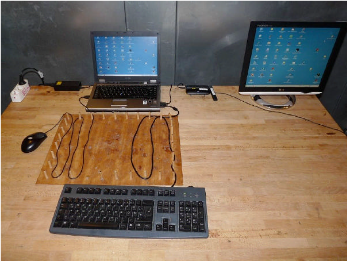
Photo 7: Test setup for conducted emissions (AC Port (power line)) EUT powered by: computer