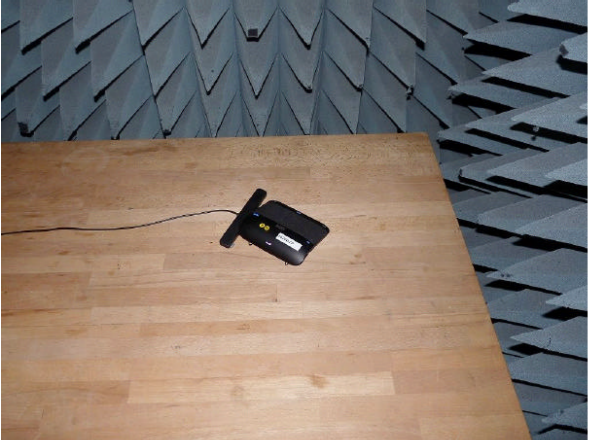
Photo 1: Test setup for radiated measurements (Enclosure, below 30 MHz)