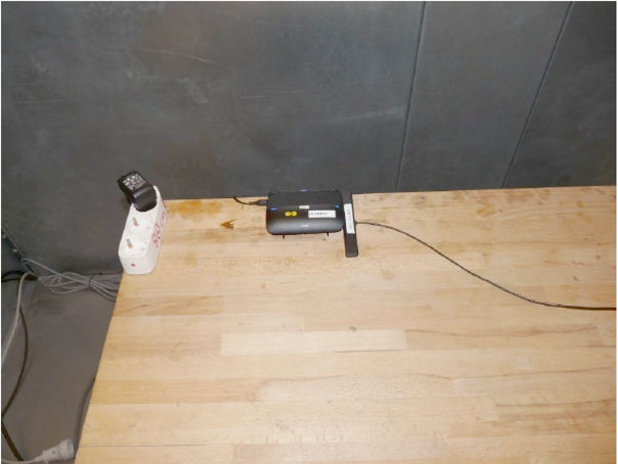
Photo 6: Test setup for conducted emissions (AC Port (power line)) EUT powered by: AC/DC converter