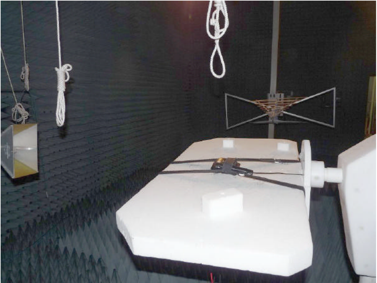
Photo 5: Test setup for radiated measurements (Enclosure, above 1 GHz)