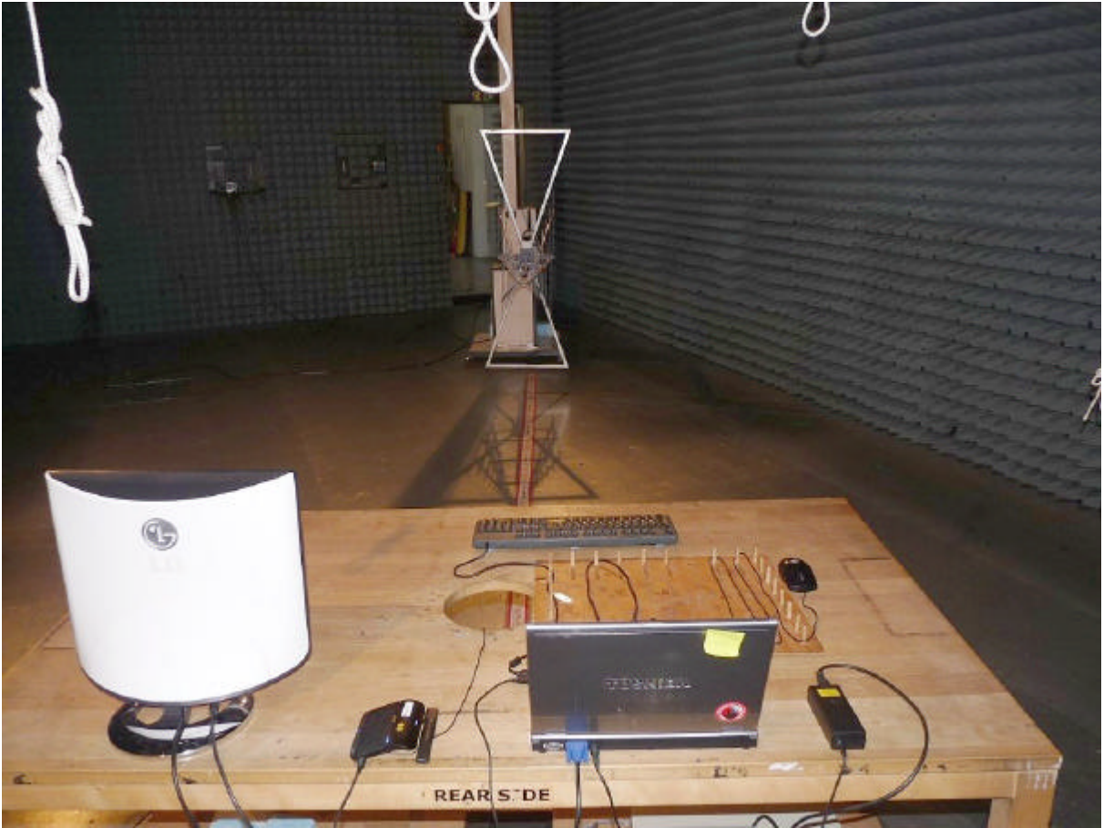
Photo 4: Test setup for radiated measurements (Enclosure, 30 MHz –1 GHz) EUT powered by: computer