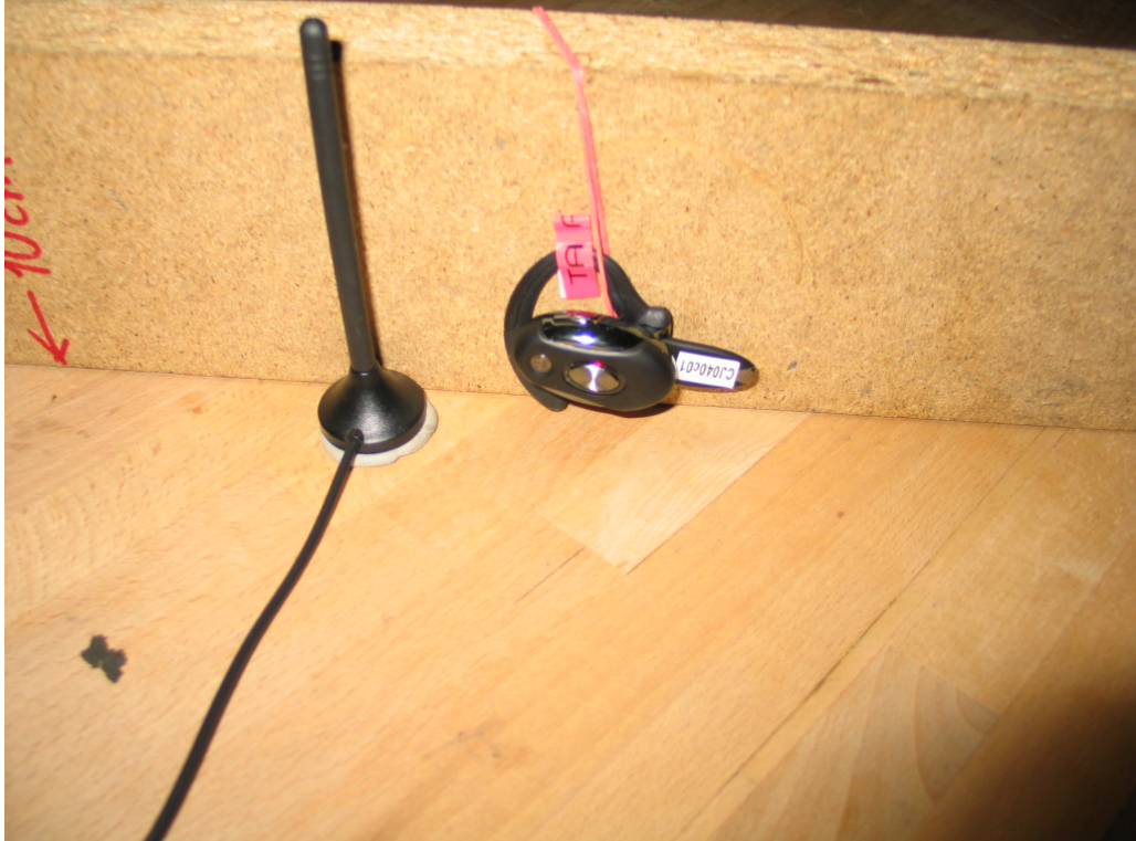
Photo 2: Test setup for radiated measurements (below 30 MHz, test on bottom side)