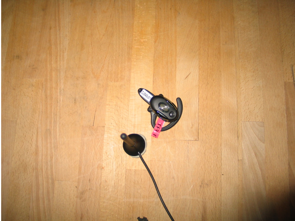
Photo 1: Test setup for radiated measurements (below 30 MHz, test on top side)