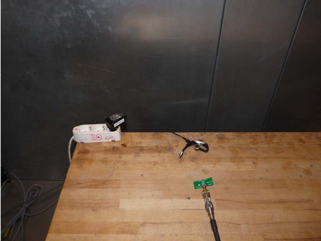
Photo 1: Test setup for conducted measurements (AC Port (power line), EUT supplied by AC/DC adapter, intentional / unintentional radiator S15)