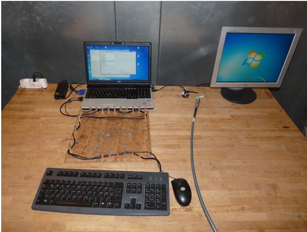
Photo 2: Test setup for conducted measurements (computer peripheral setup, EUT supplied by USB-cable from computer, unintentional radiator §15)