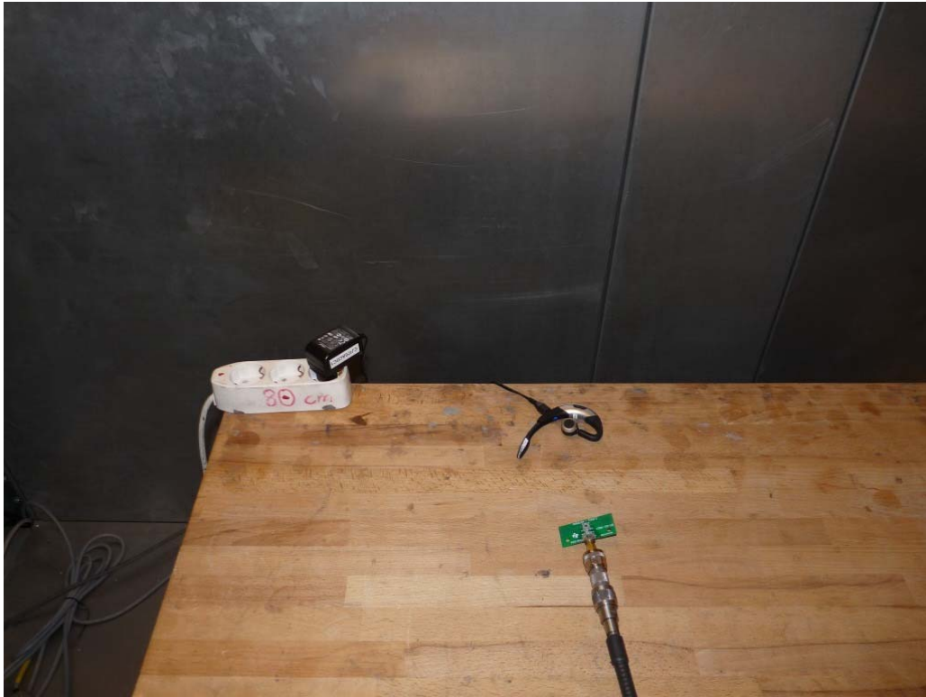
Photo 1: Test setup for conducted measurements (AC Port (power line), EUT supplied by AC/DC adapter, intentional / unintentional radiator S15)