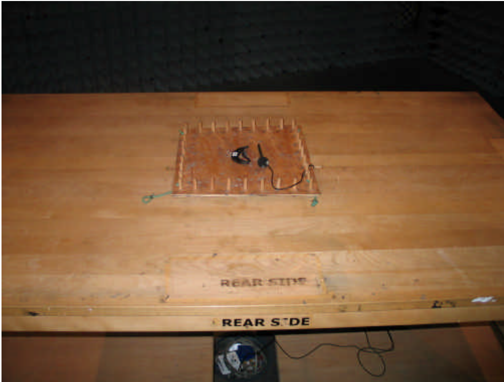
Photo 1: Test setup for radiated measurements (Enclosure, 30 MHz to 1 GHz)