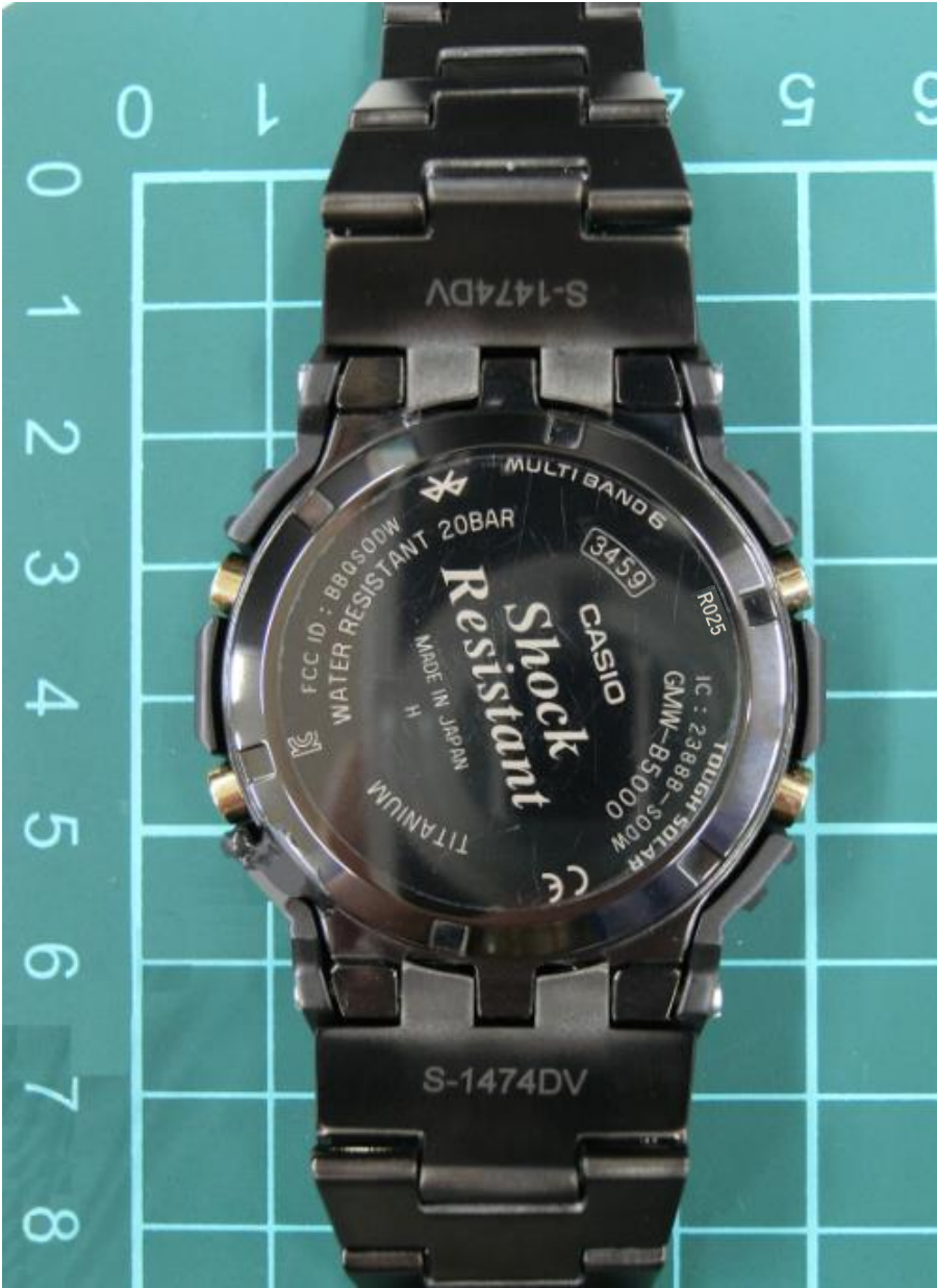
GMW-B5000(Titan version)_CW3459 BackPhoto