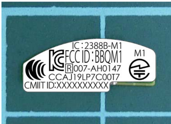
M1 board With label attached