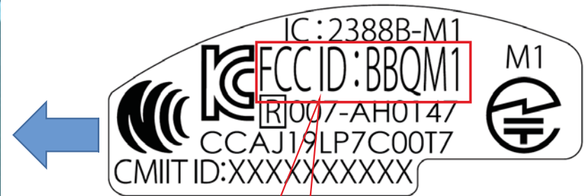
M1 Certificate Label