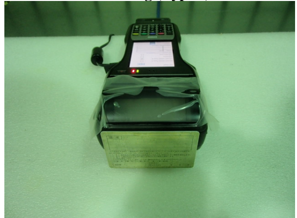
With Tag (TypeB)