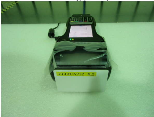
With Tag (Felica)