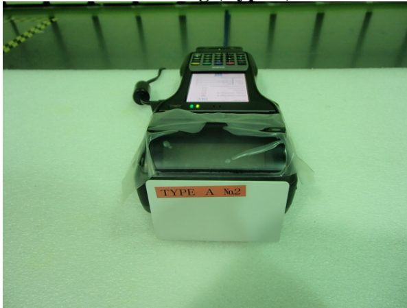
With Tag (TypeA)