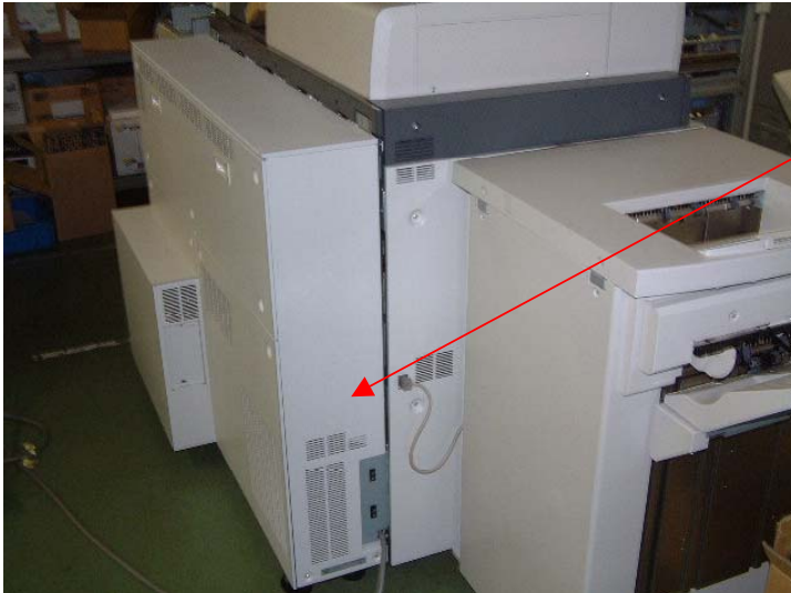
rear left frame