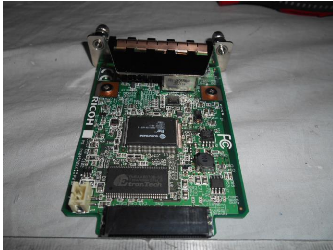
original option card

Please be notified that we, the undersigned, Ricoh Co., Ltd declare that that the reason for this Class II permissive change is only to add a new option card.