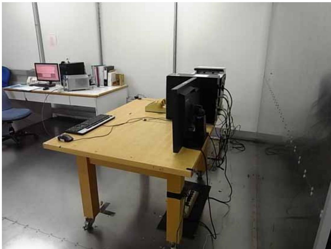
BACK VIEW OF CONDUCTED MEASUREMENT