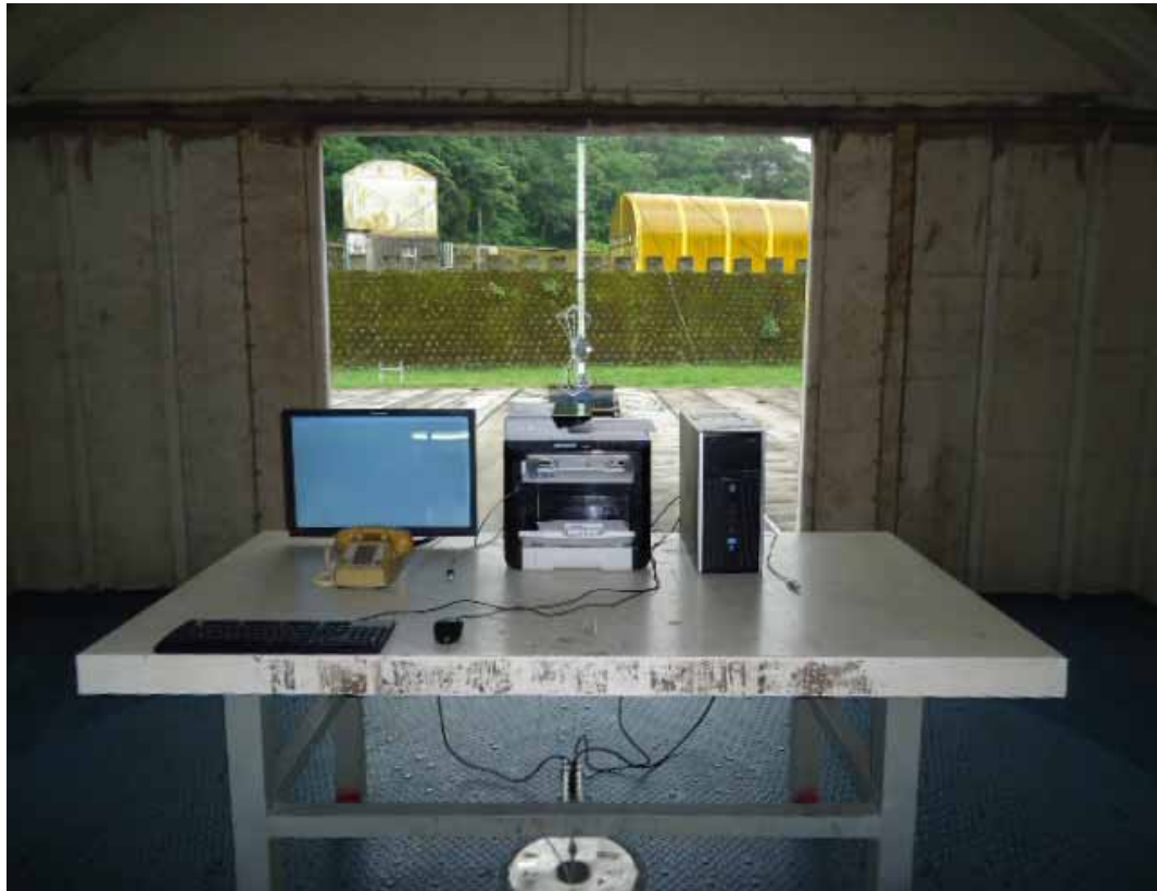
FRONT VIEW OF RADIATED MEASUREMENT