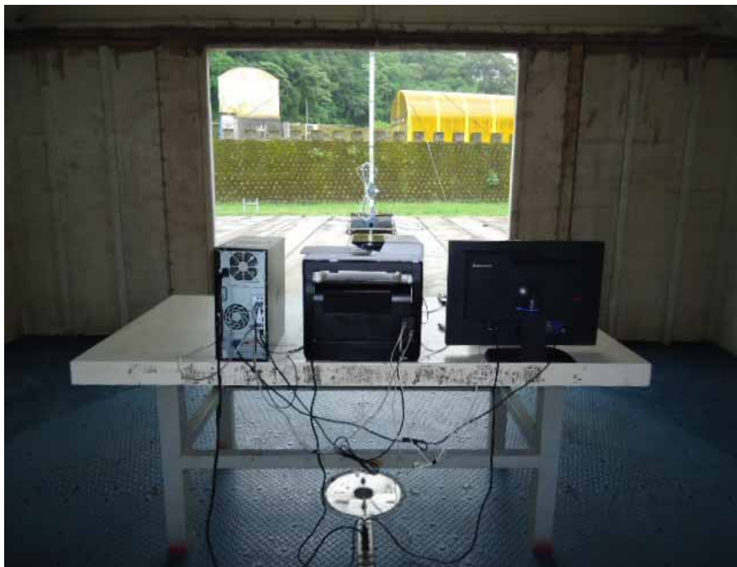
BACK VIEW OF RADIATED MEASUREMENT