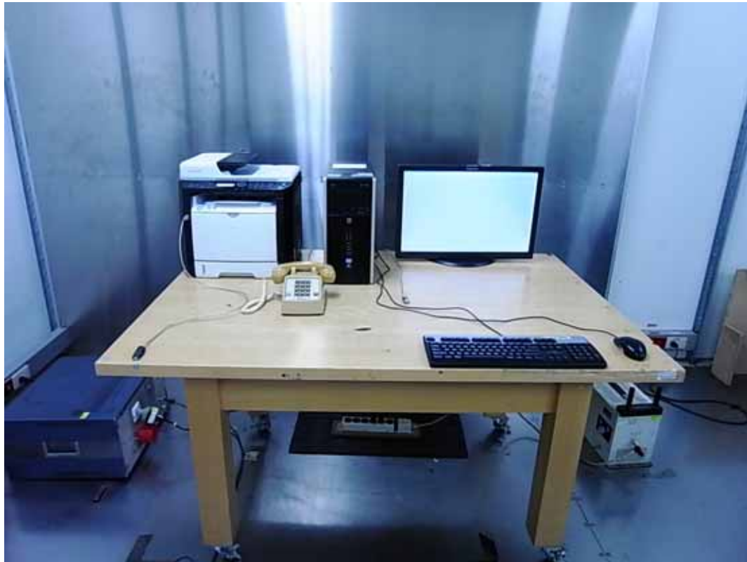
FRONT VIEW OF CONDUCTED MEASUREMENT