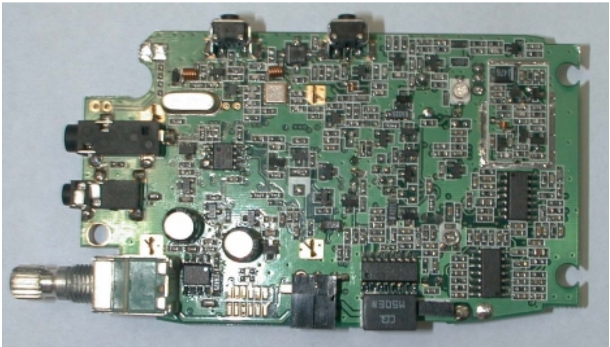
PCB Bottom w/o Shield