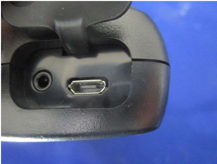
PORT VIEW – TOP OF RADIO