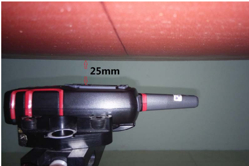
Face-held, the front of the EUT towards phantom (The distance was 25mm)