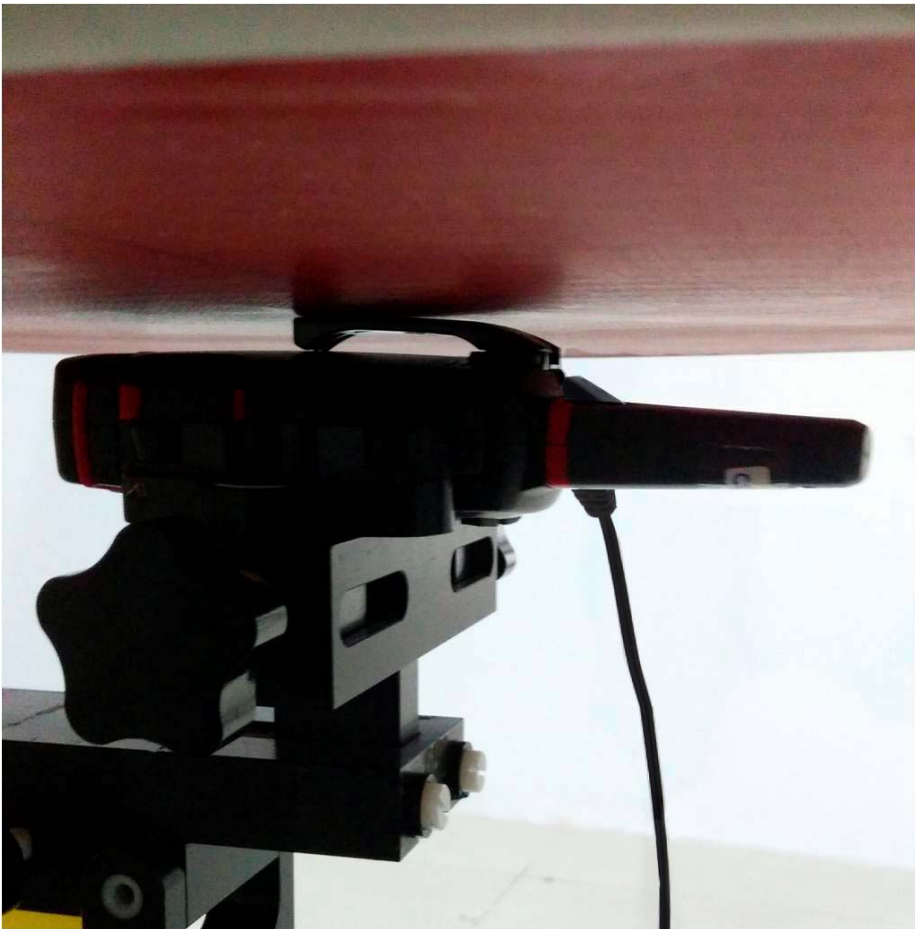
Photo of Body-worn Configuration