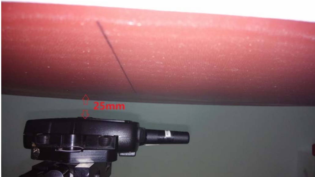
Face-held, the front of the EUT towards phantom (The distance was 25mm)