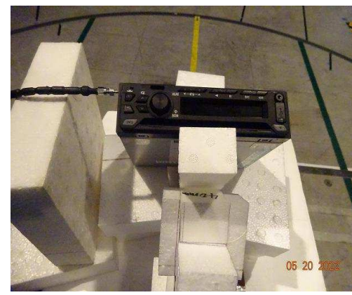
( RX-ANT_View )