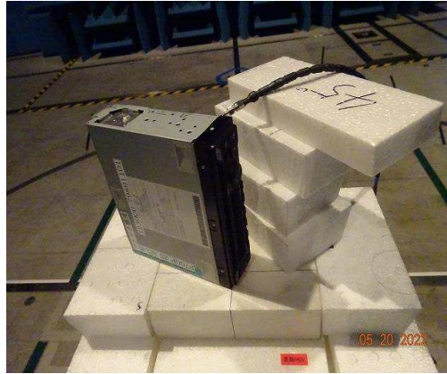
( RX-ANT_View )