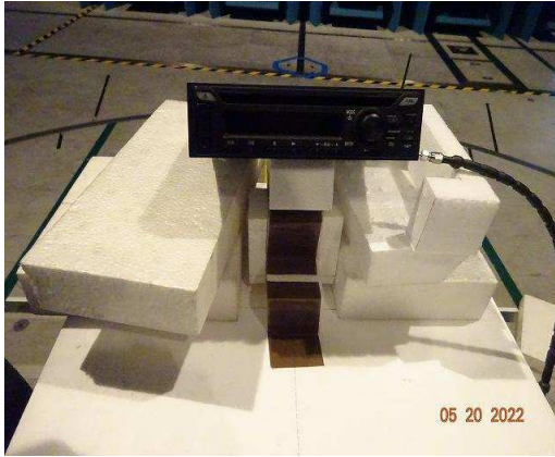
( RX-ANT_View )