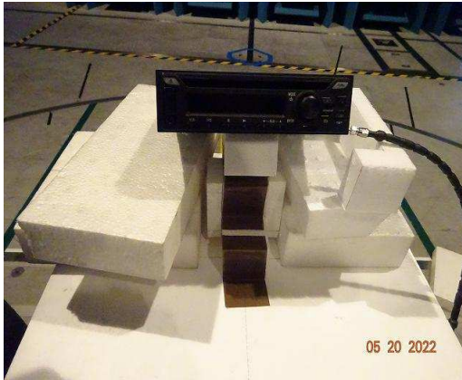
( RX-ANT_View )