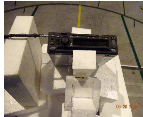
( RX-ANT_View )