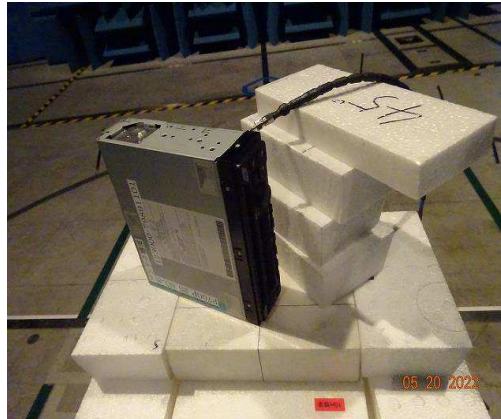
( RX-ANT_View )