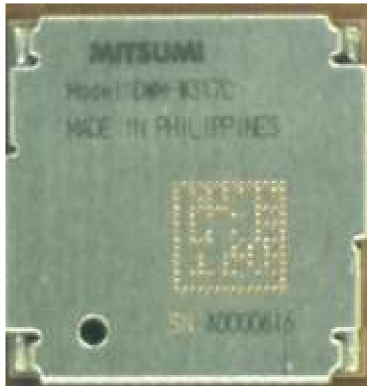
External Photo (TOP)