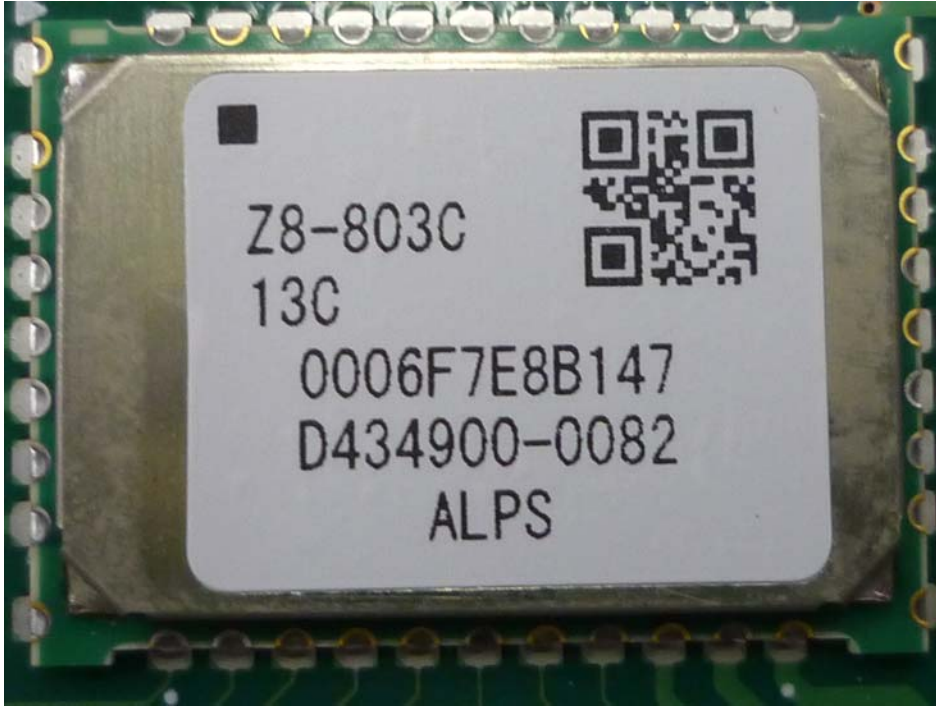
Bluetooth module (with shielded cover)