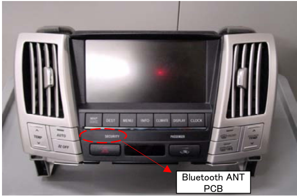
Bluetooth ANT PCB