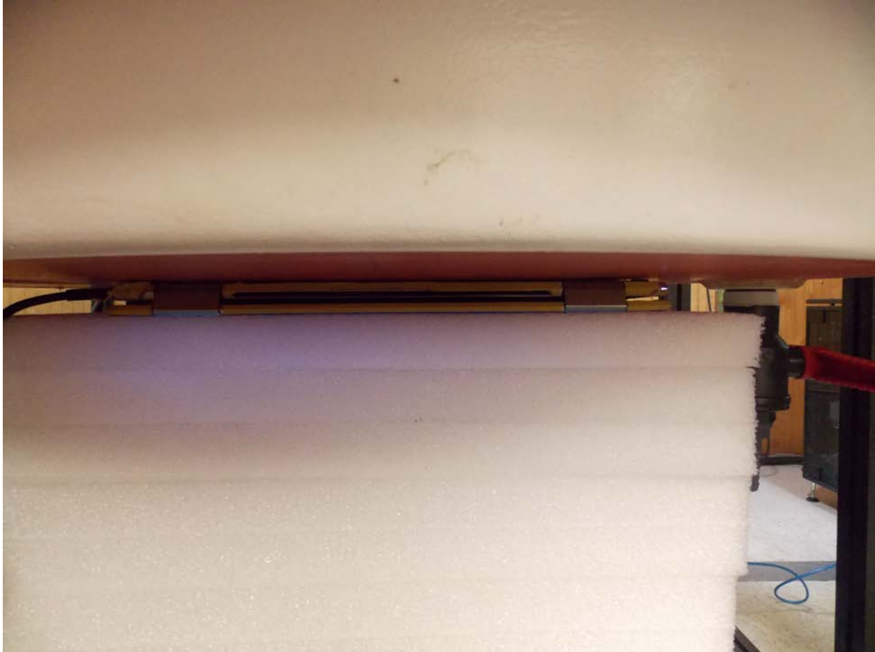
Test Position Back 0 mm Gap

Note: All cables are removed prior to testing.