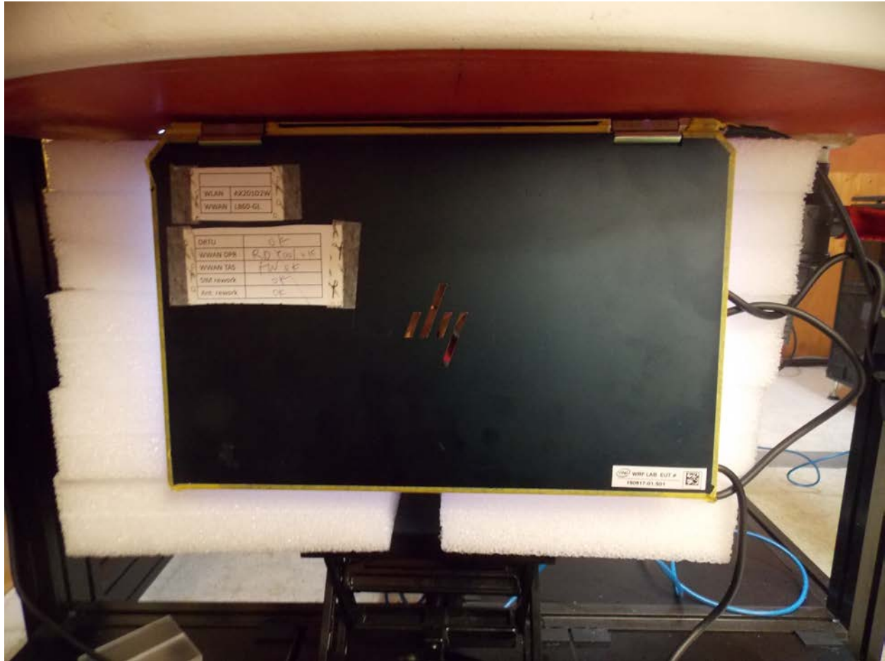
Test Position Laptop 0 mm Gap

Note: All cables are removed prior to testing.