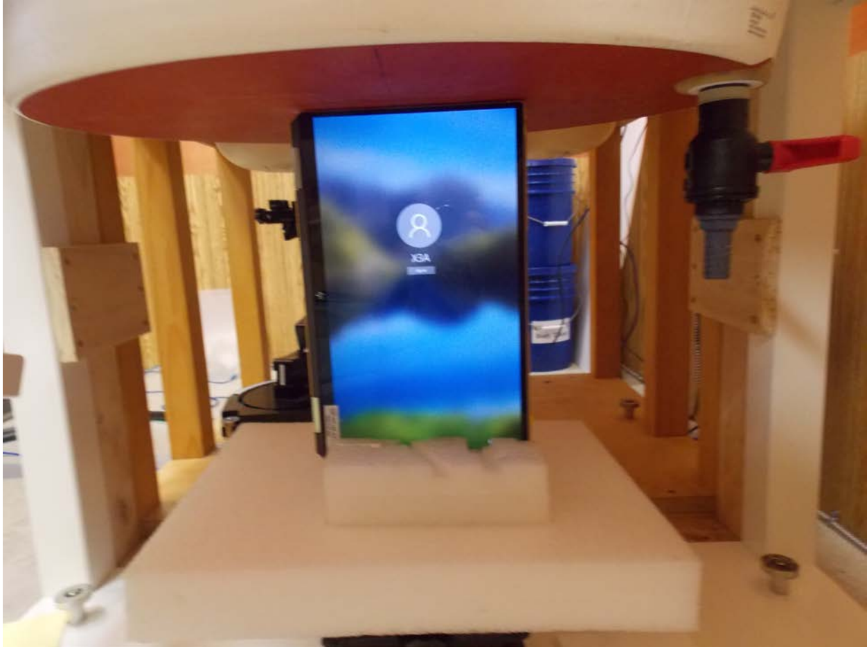
Test Position Left 0 mm Gap

Note: All cables are removed prior to testing.