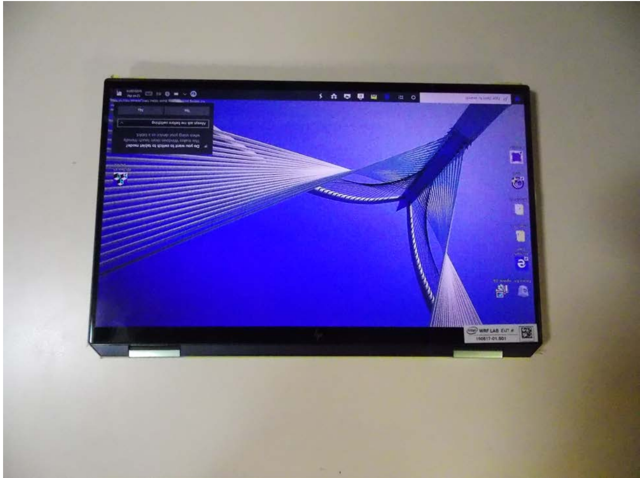
Front of Device Tablet Mode