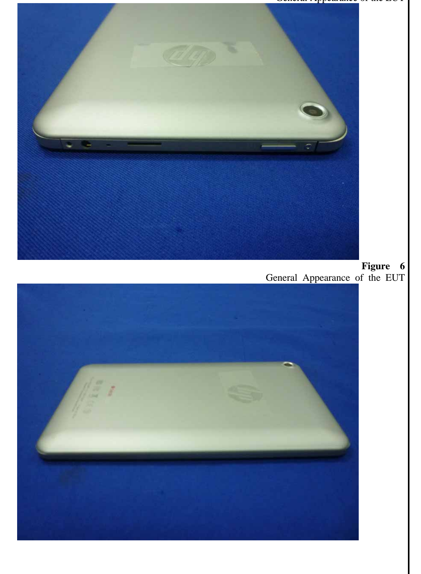
Figure 5 General Appearance of the EUT