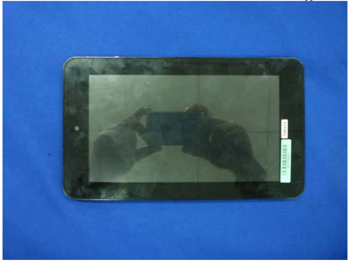
Audix Technology (Shenzhen) Co., Ltd. Report No. ACS-F13059