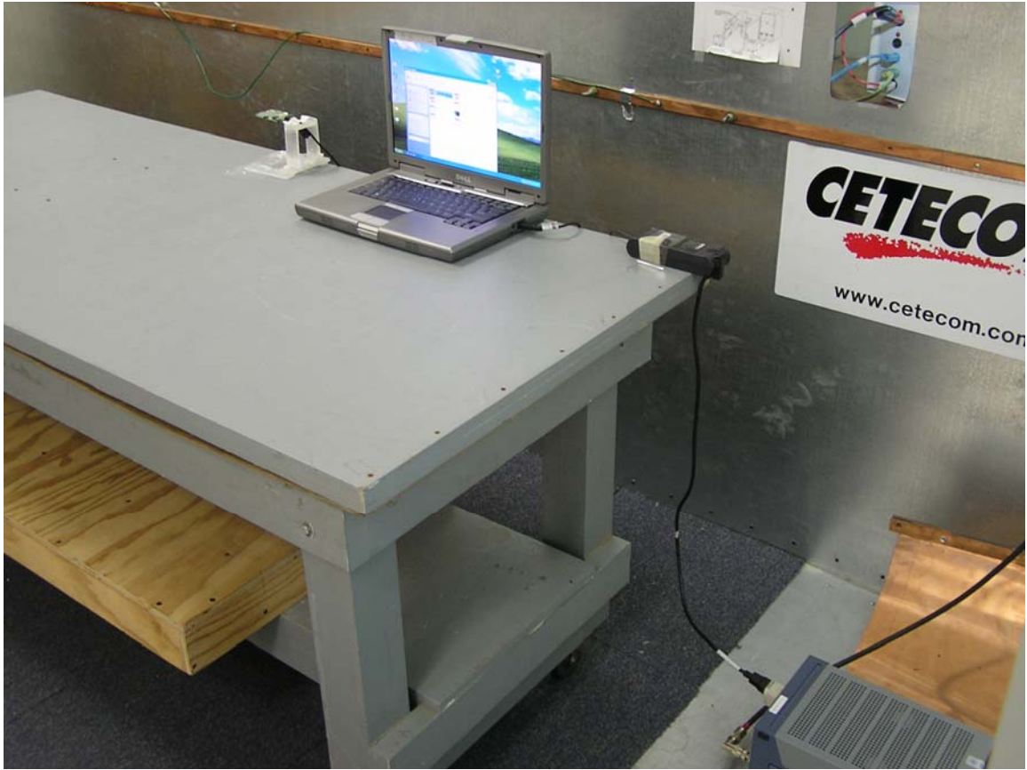
Test setup AC line conduction.