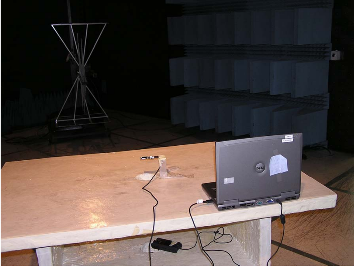
Test setup – Radiated measurements with USB 2.0