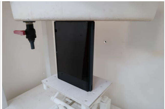
Edge4 at 0 mm