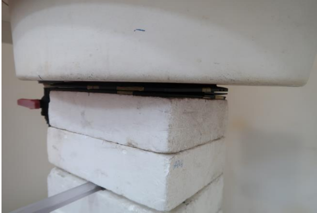
Bottom Face at 0mm