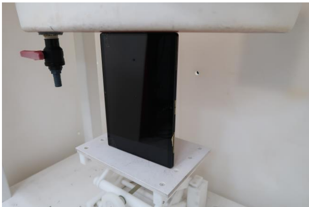
Edge2 at 0 mm