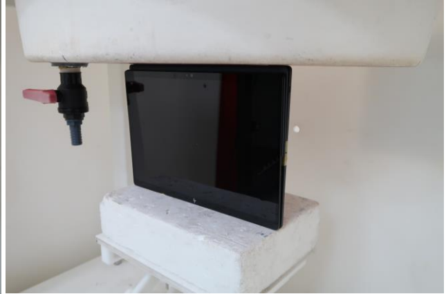
Edge1 at 0 mm