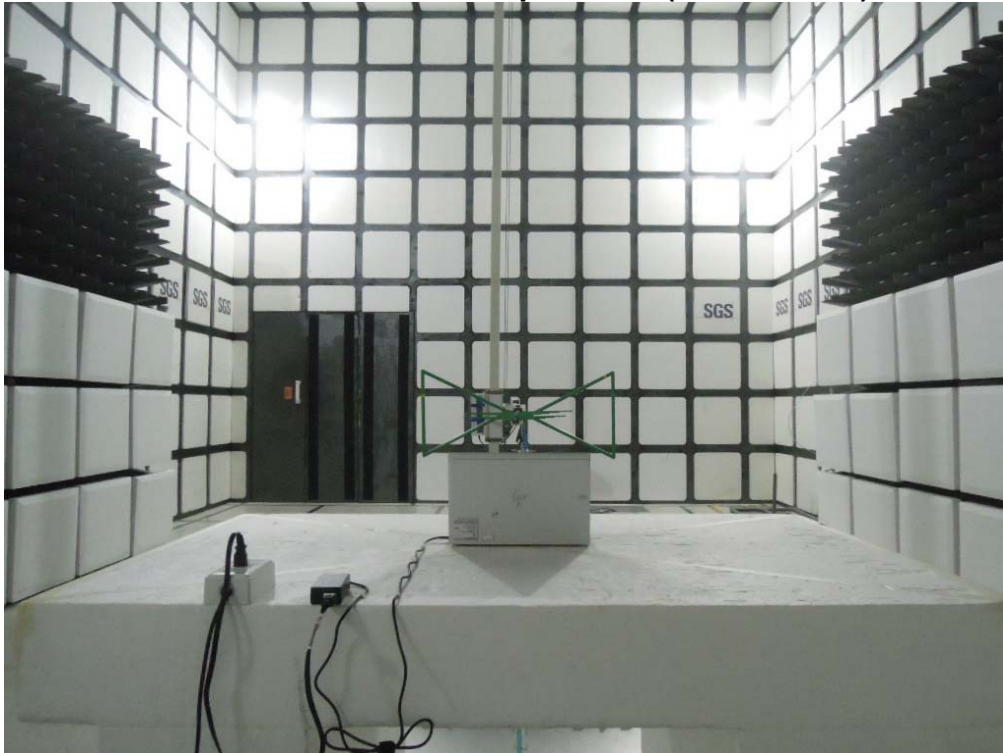
Radiated Emission Set up Photos (Above 1GHz)