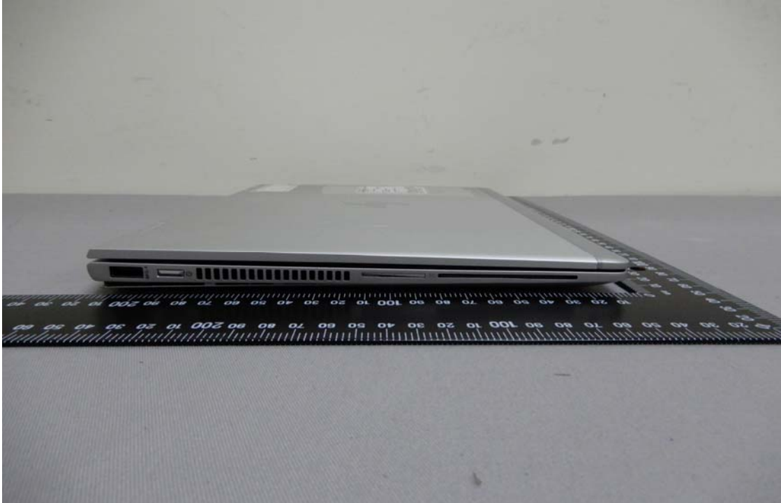
Side View of EUT – 3