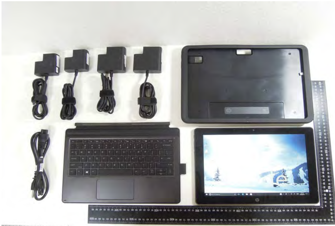
Front View of EUT - 1