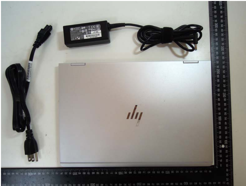
Front View of EUT - 1