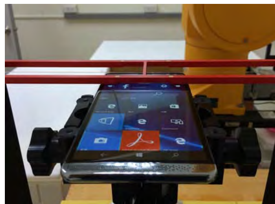
Fig. 2 Receiver of mobile contact center of Arch

Unless otherwise stated the results shown in this test report refer only to the sample(s) tested and such sample(s) are retained for 90 days only.