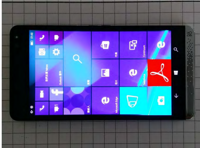
Fig. 3 Front view of EUT