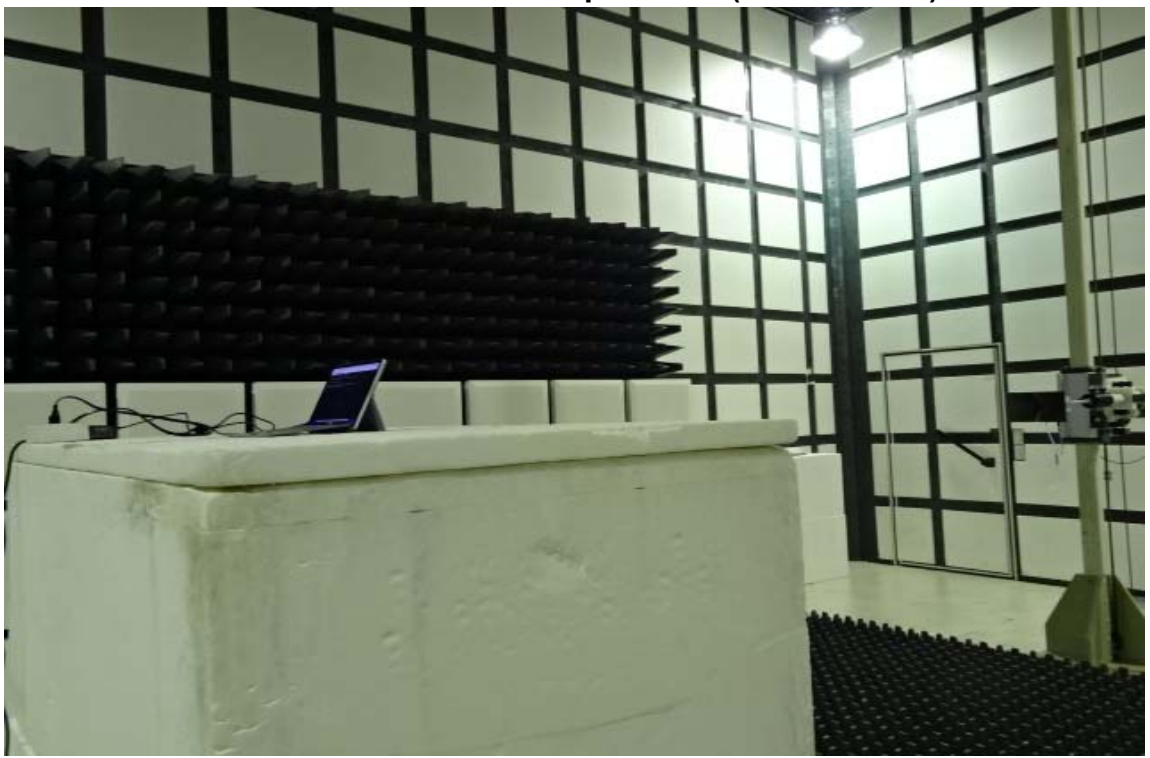
Radiated Emission Set up Photos (Front View)

Radiated Emission Set up Photos (Above 1GHz)