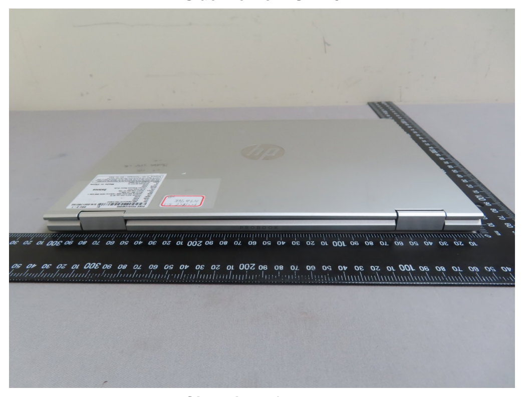
Side View of EUT - 4