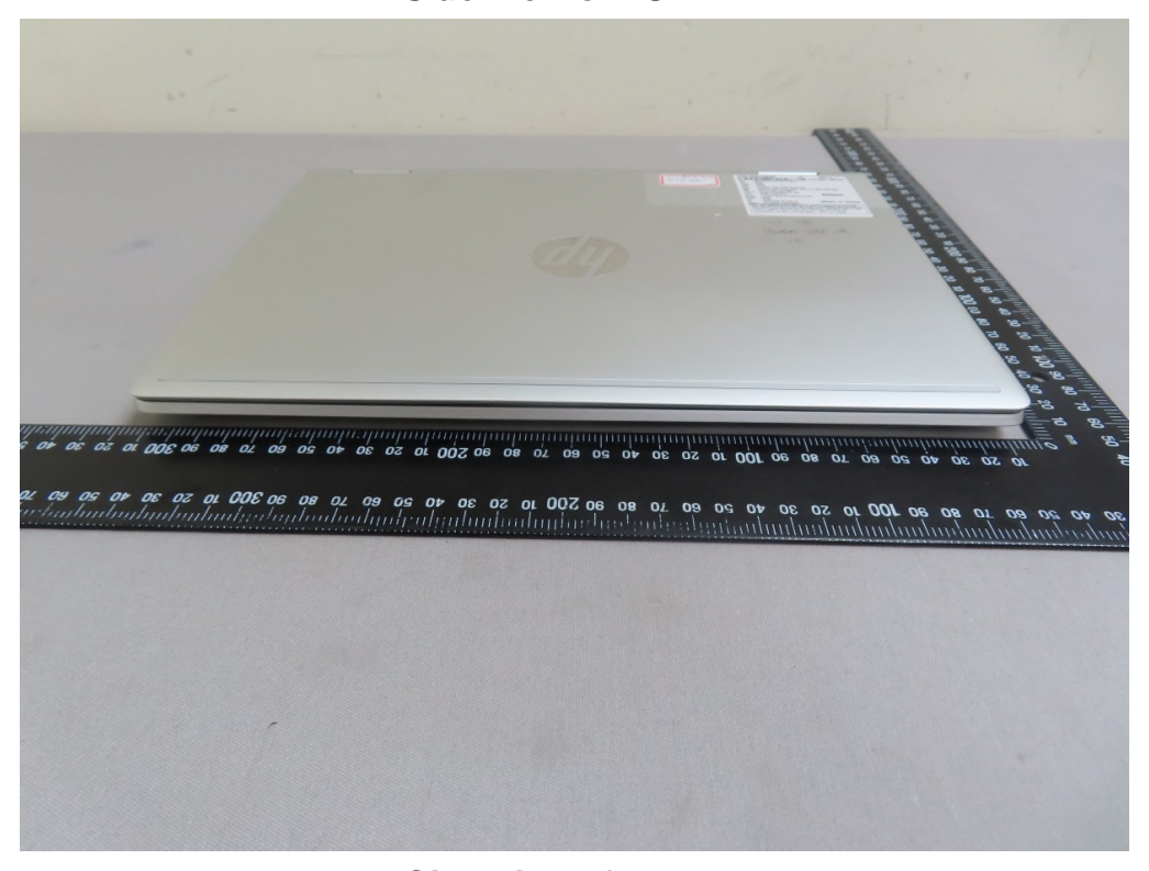
Side View of EUT - 2