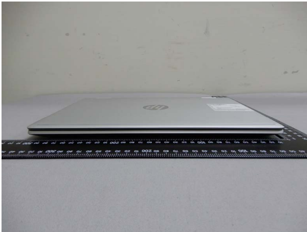
Side View of EUT – 2