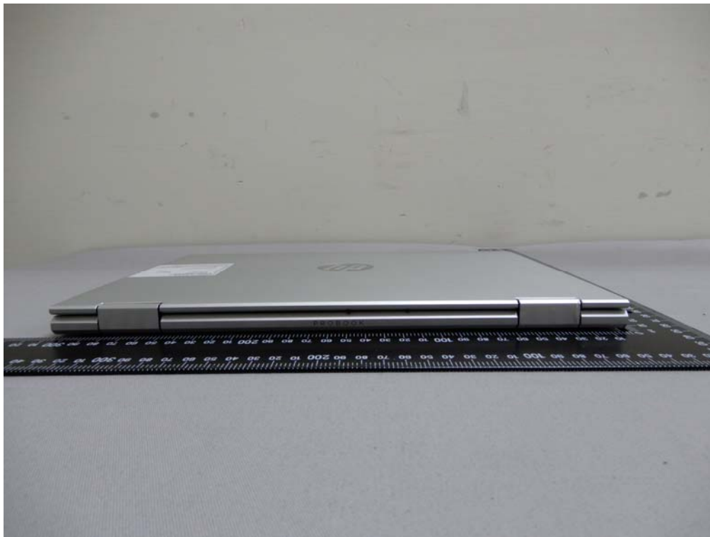
Side View of EUT – 4