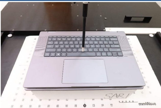
Bottom Face at 2 mm