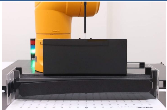
Edge 1 at 2 mm