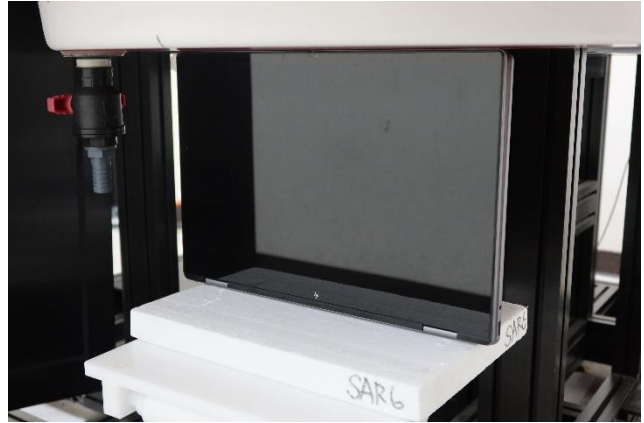
Edge 1 at 0 mm