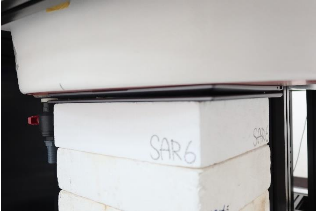
Bottom Face at 0 mm