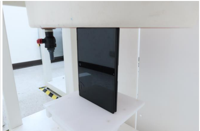
Edge4 at 0 mm