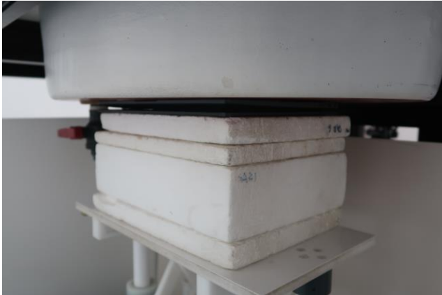
Bottom Face at 0 mm