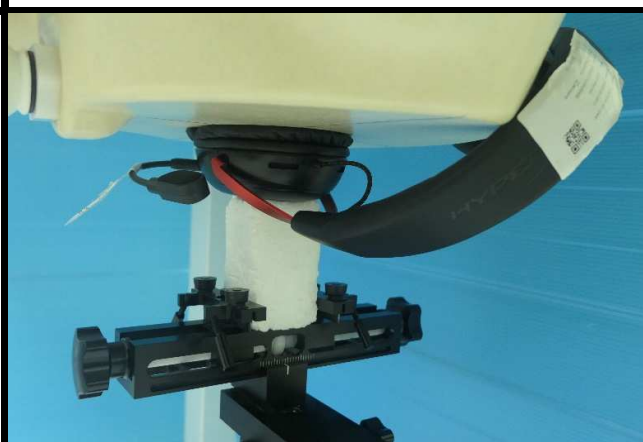
Left Ear of EUT With Microphone Battery SKU 2 Tested at 0 mm