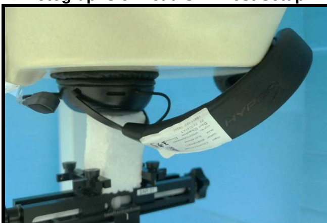
Left Ear of EUT With Microphone Battery SKU 1 Tested at 0 mm