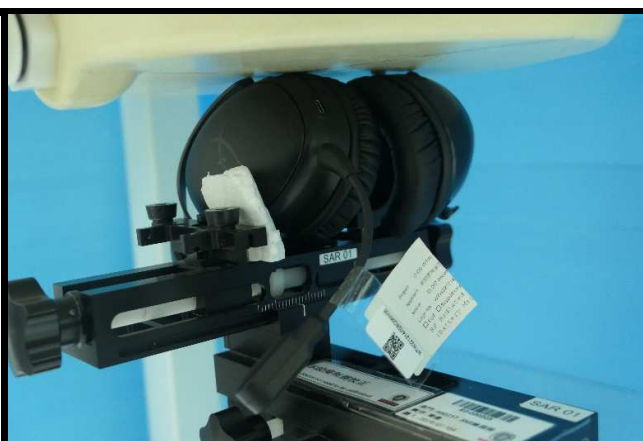
Rear Face of EUT With Microphone Battery SKU 1 Tested at 0 mm