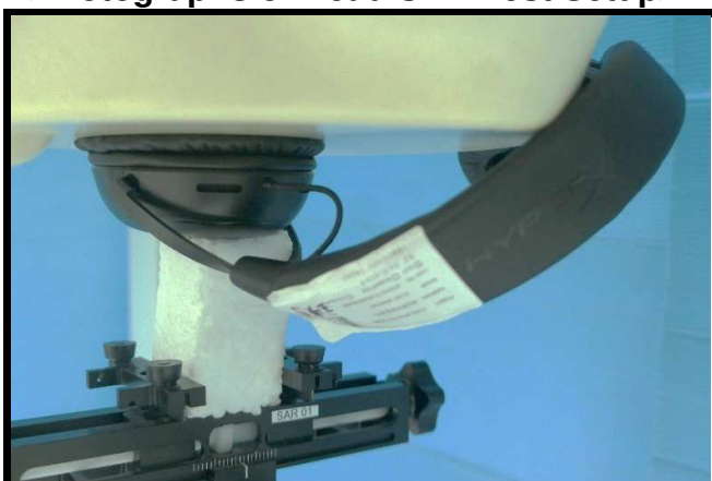
Left Ear of EUT Without Microphone Battery SKU 1 Tested at 0 mm