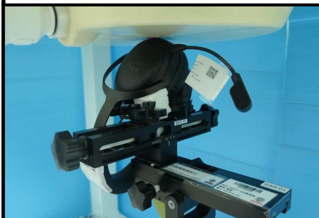
Bottom Side of EUT With Microphone Battery SKU 1 Tested at 0 mm