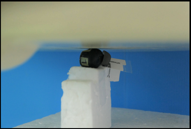
Bottom Side of EUT Tested at 0 mm