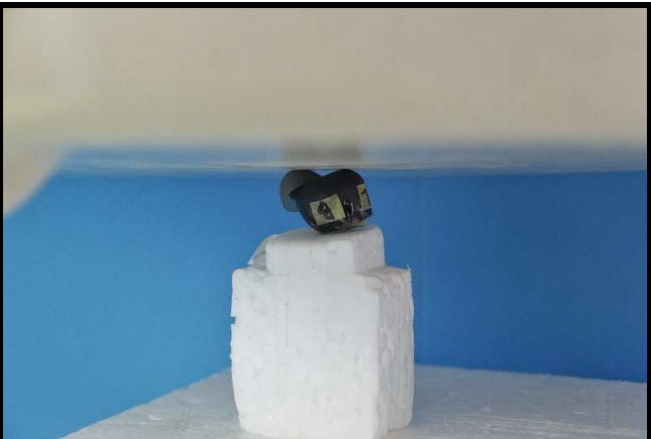
Rear Face of EUT Tested at 0 mm