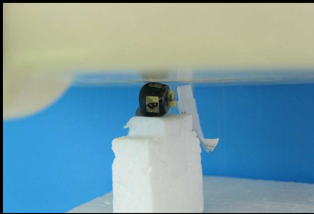
Left Side of EUT Tested at 0 mm