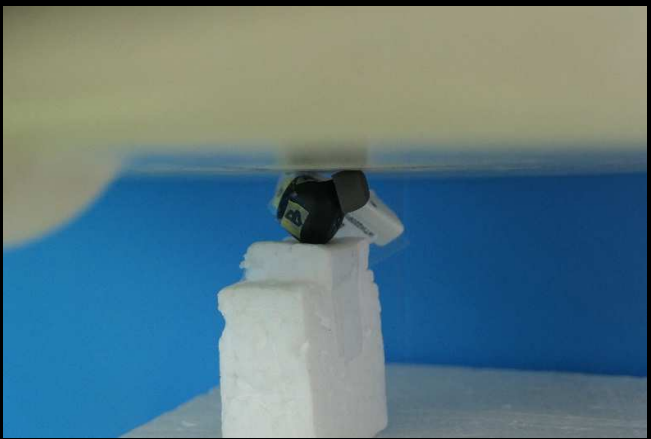
Right Side of EUT Tested at 0 mm