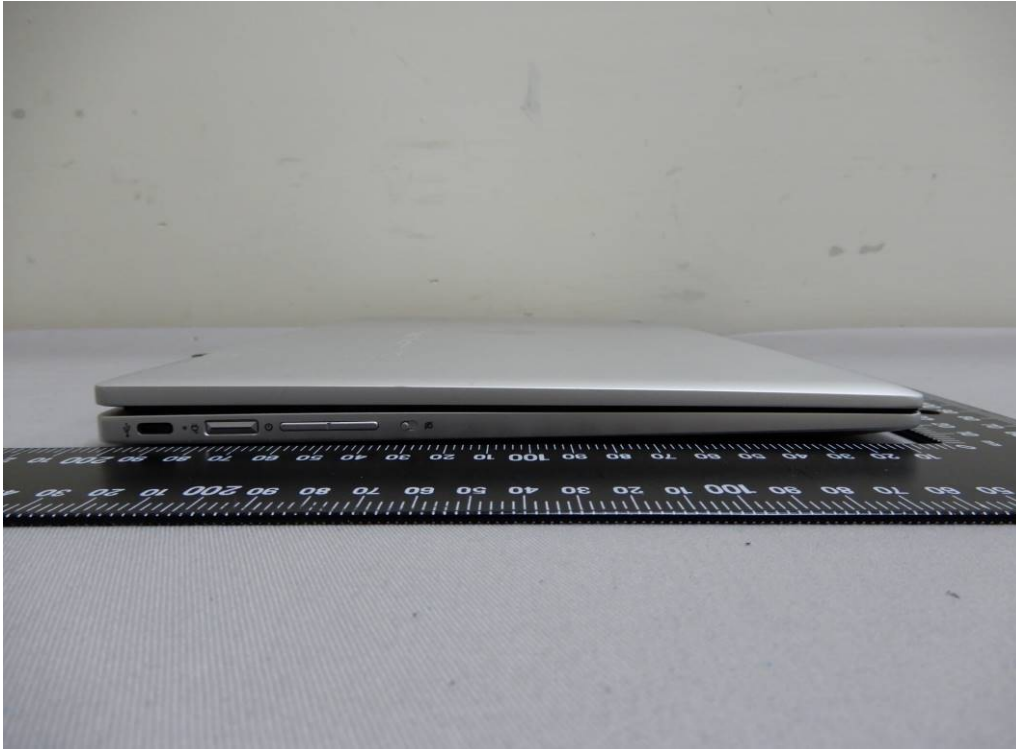
Side View of EUT – 3