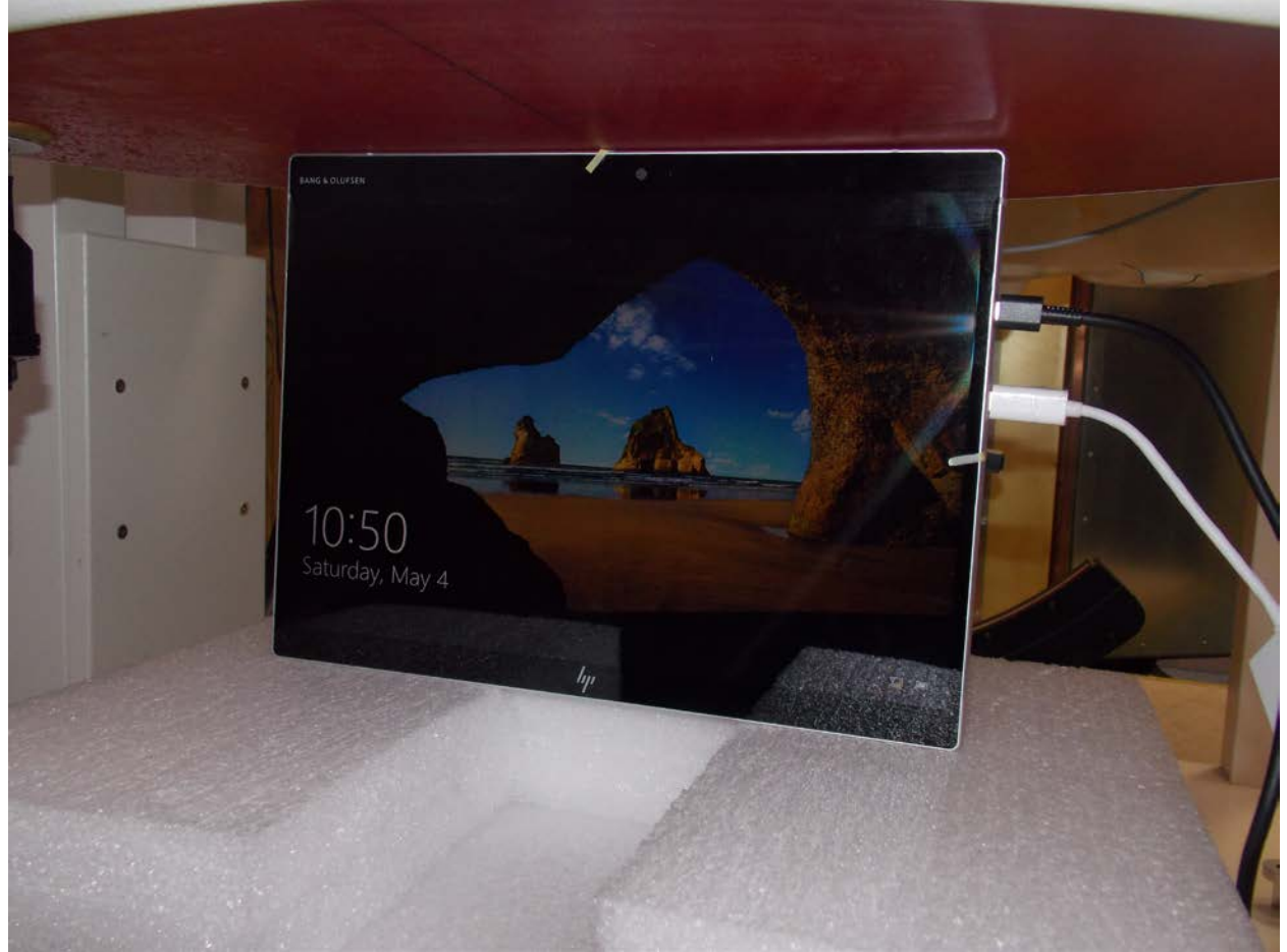
Test Position Top 0 mm Gap