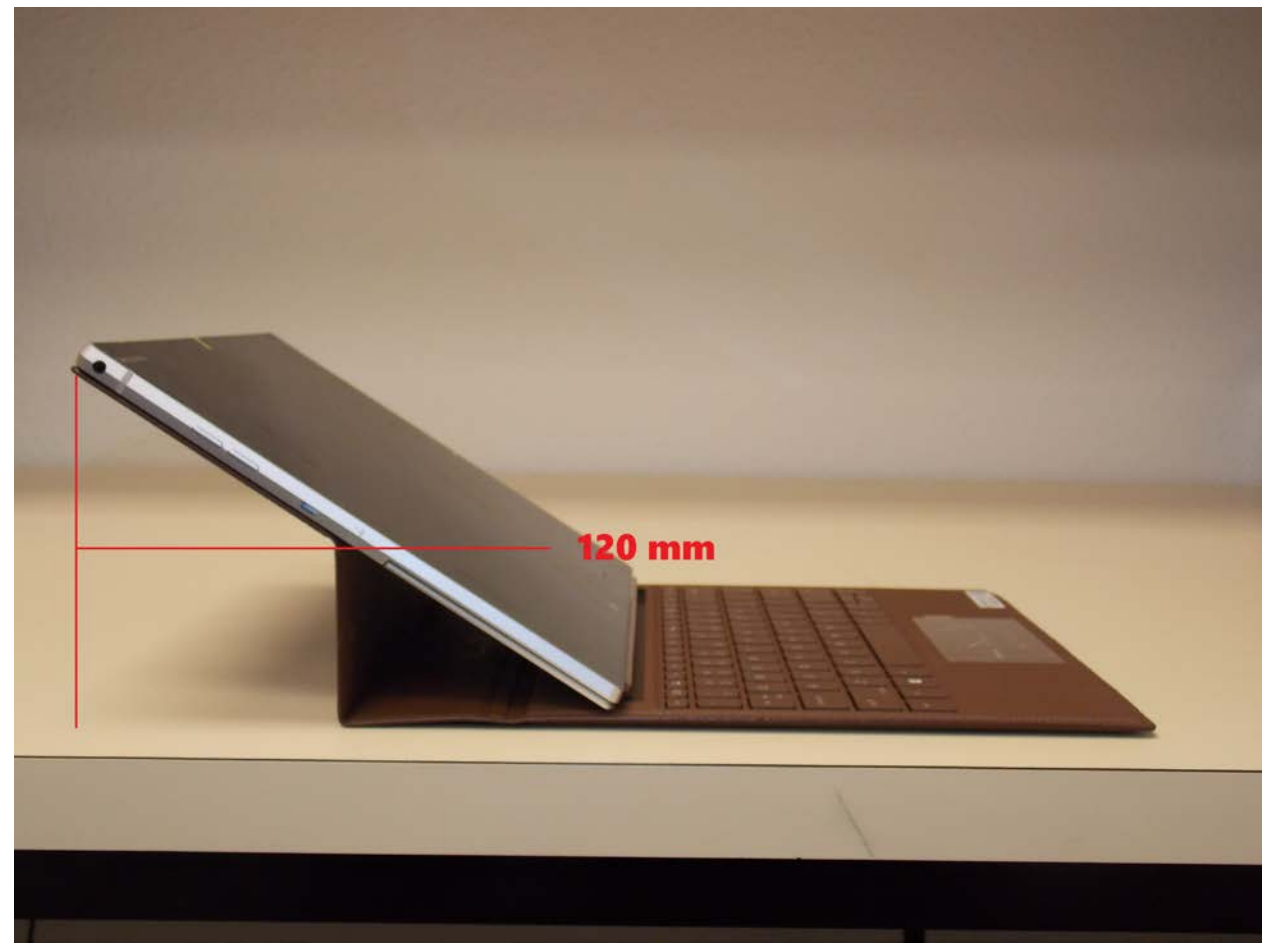
Laptop Mode Brown Case Configuration #2