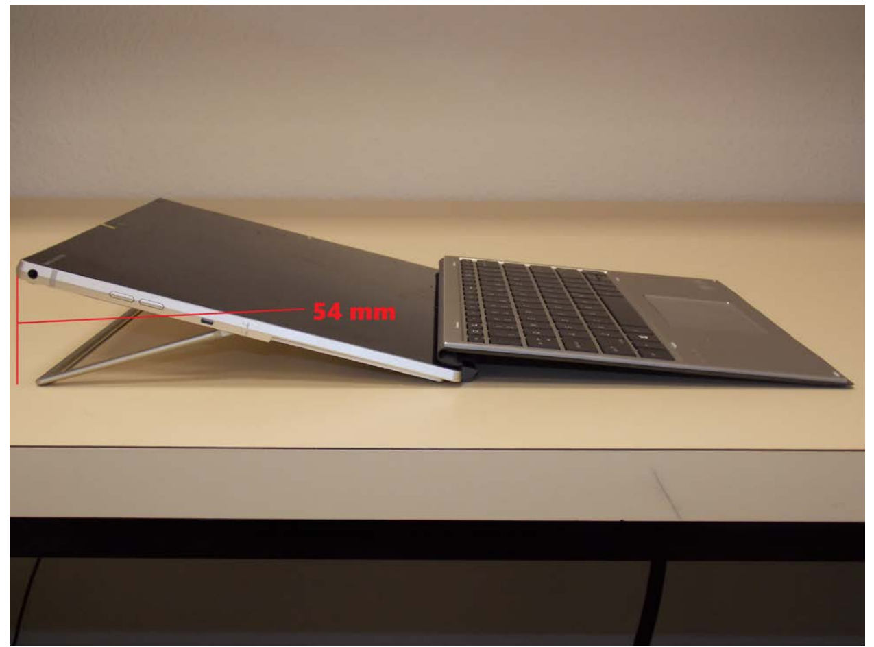
Laptop Mode Gray Case Configuration #2