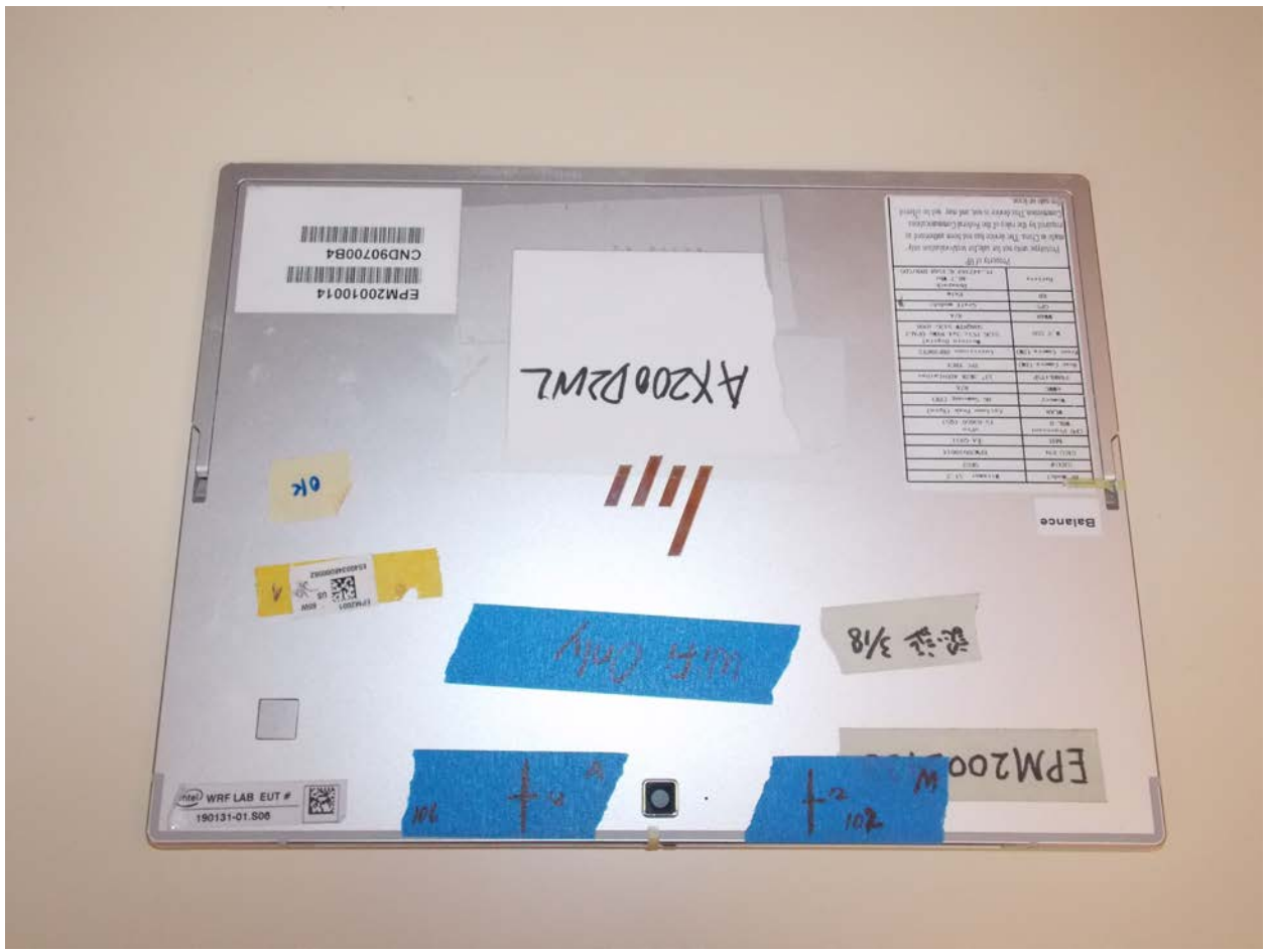
Back of Device Tablet Mode