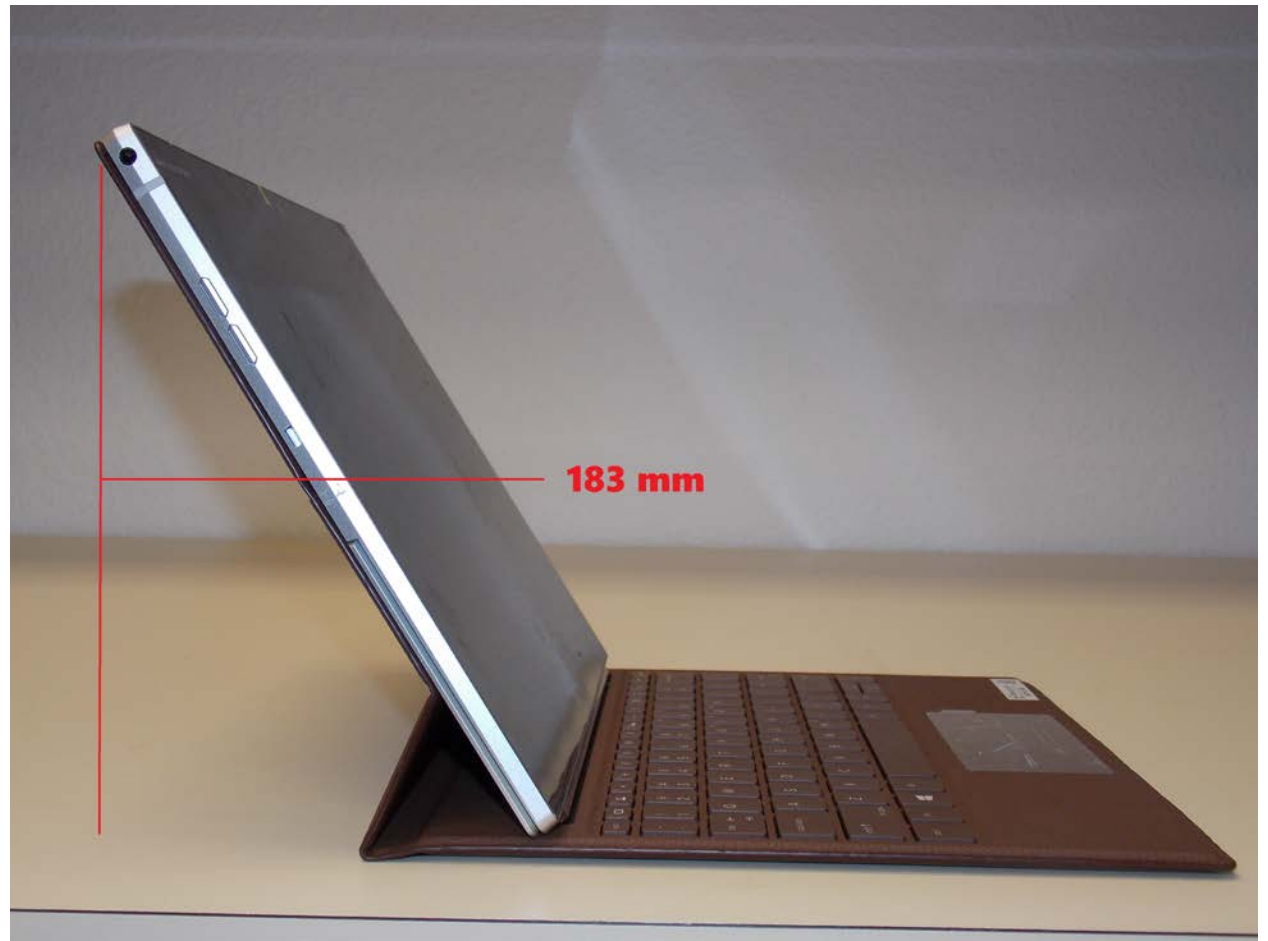
Laptop Mode Brown Case Configuration #1