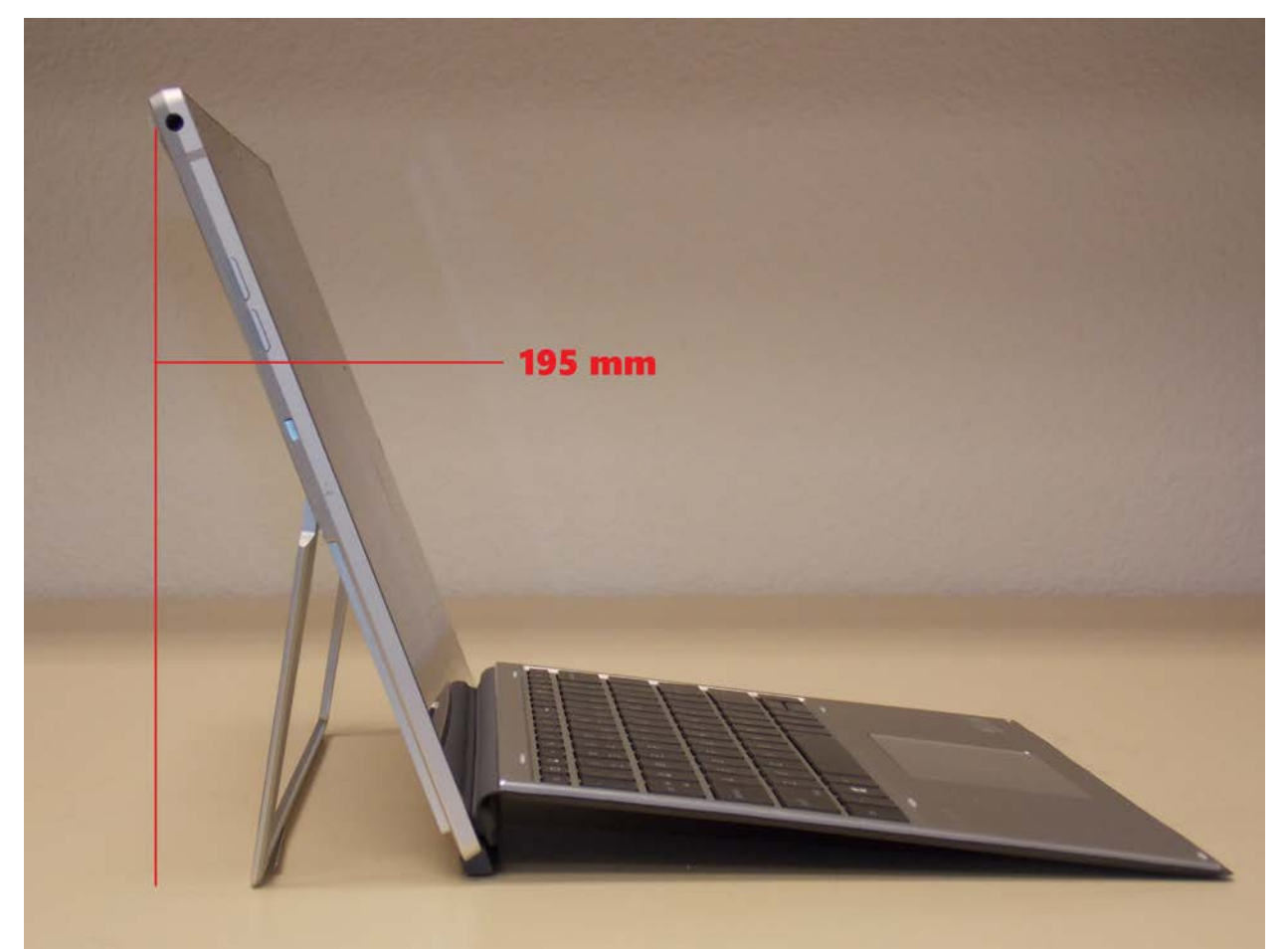
Laptop Mode Gray Case Configuration #1