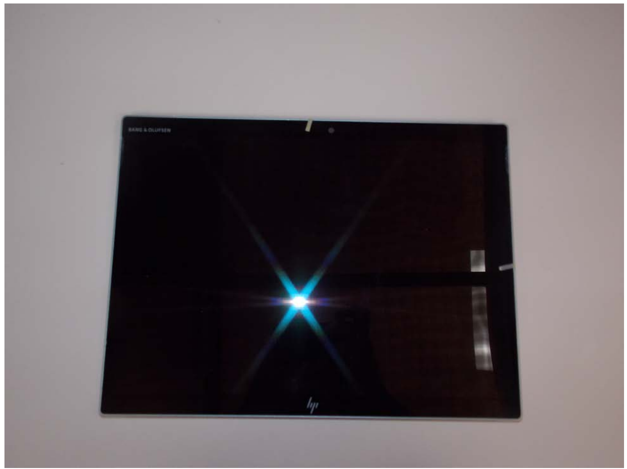
Front of Device Tablet Mode