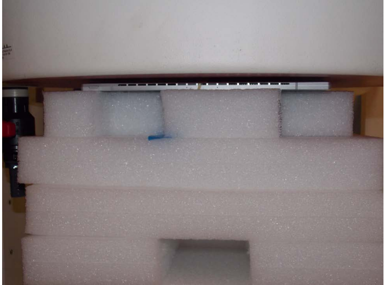
Test Position Back with Gray Case