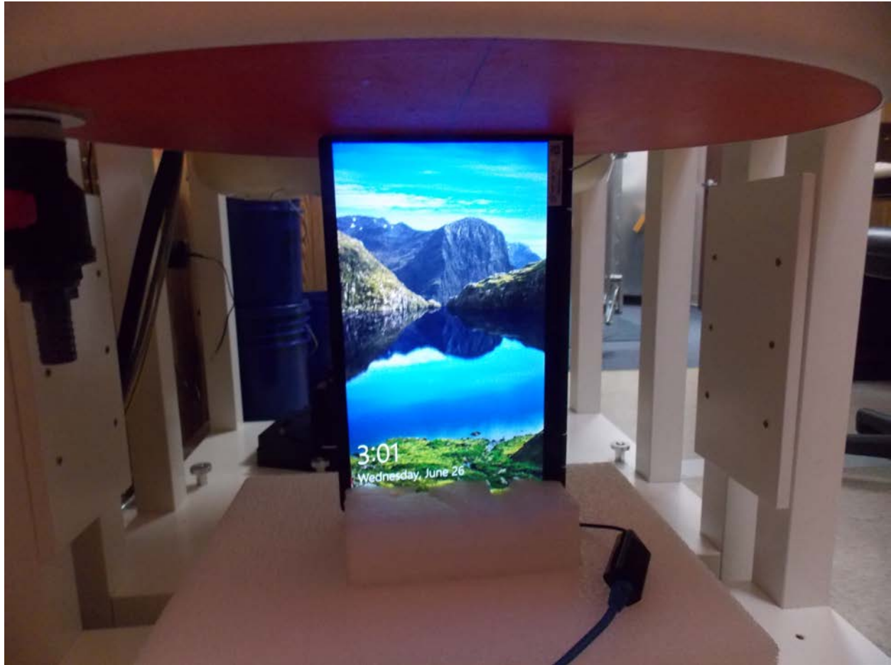
Test Position Right 0 mm Gap

Note: All cables are removed prior to testing.