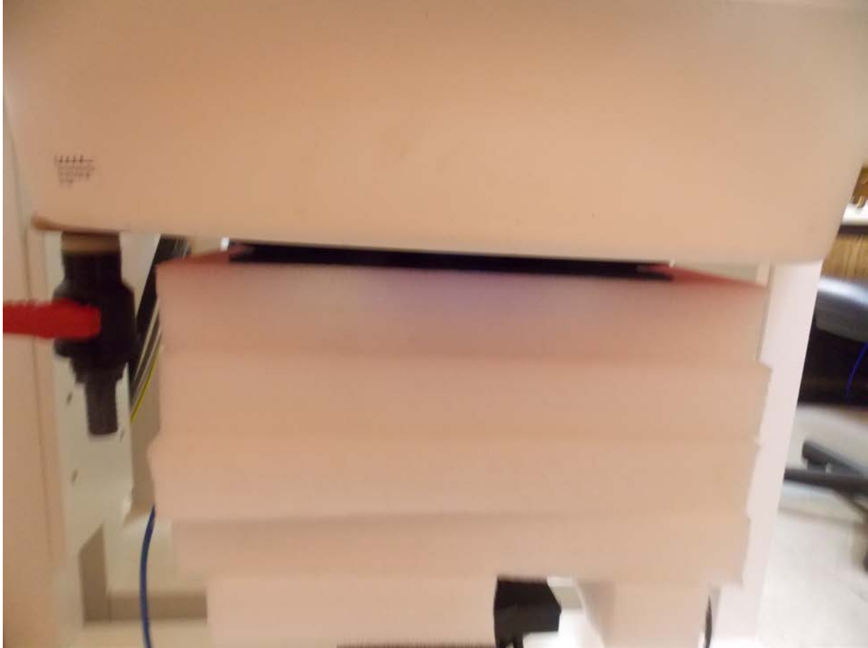
Test Position Back 0 mm Gap

Note: All cables are removed prior to testing.