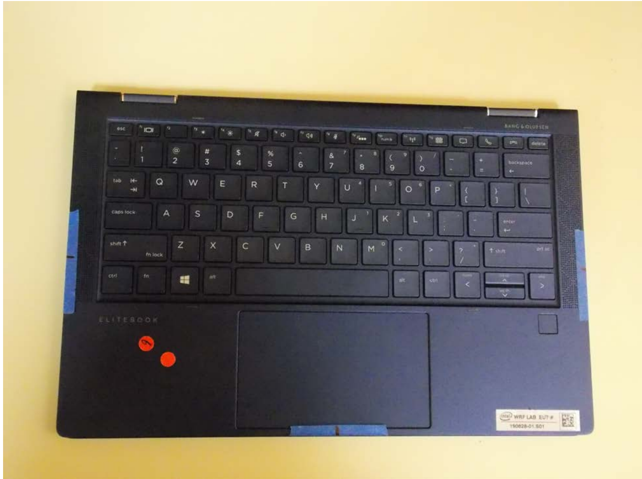
Back of Device Tablet Mode