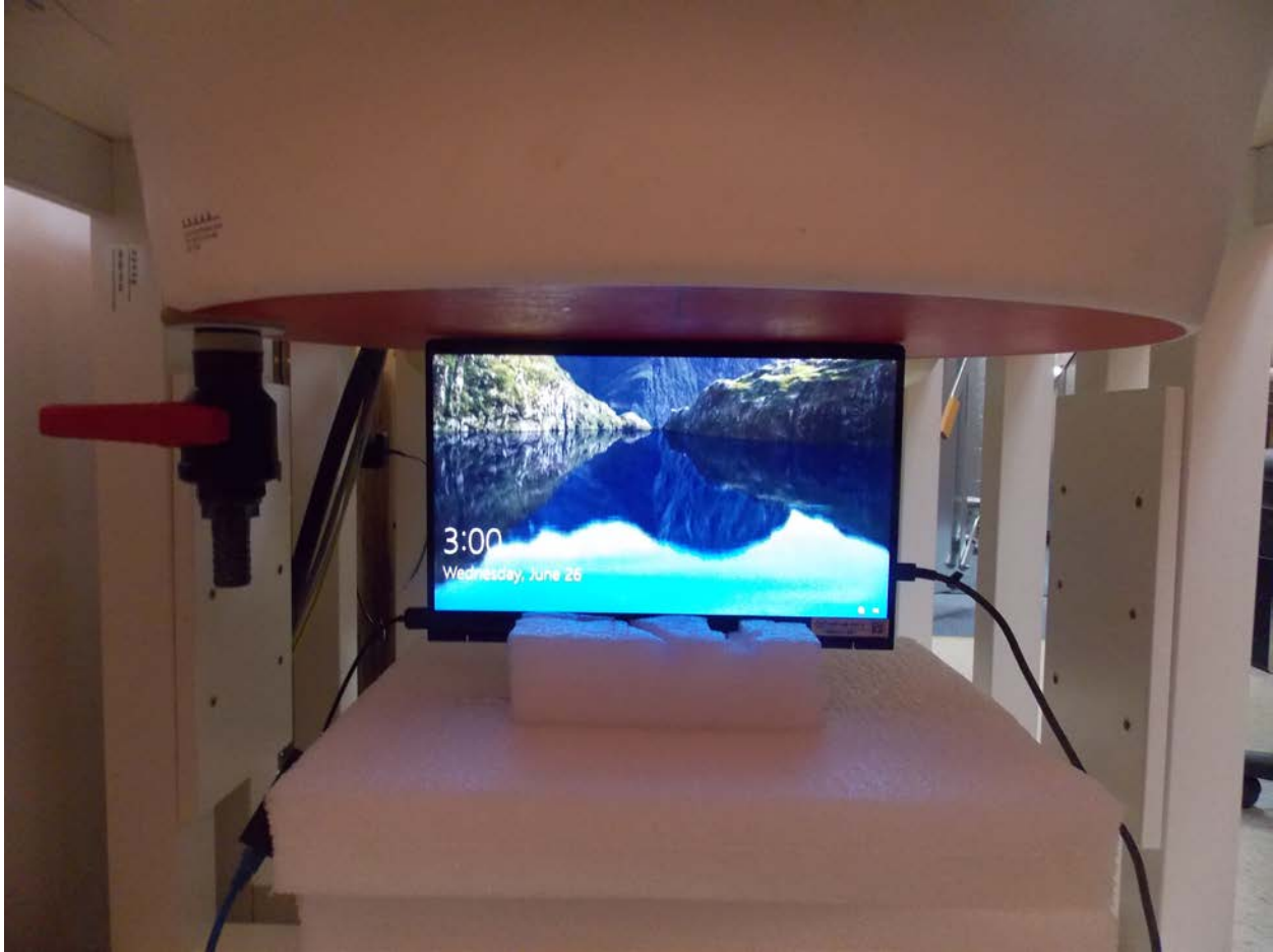
Test Position Top 0 mm Gap

Note: All cables are removed prior to testing.