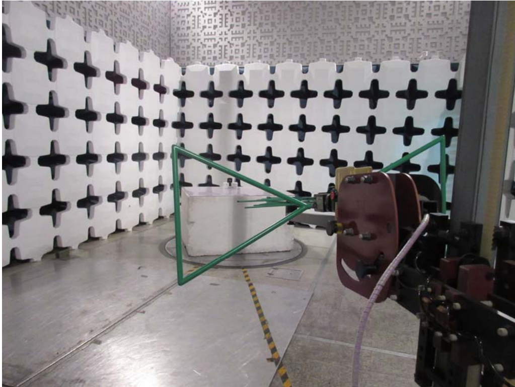
Test Setup for Radiated Emissions, 30MHz to 1GHz – Horizontal Polarization