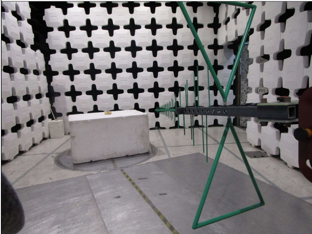
Test Setup for Spurious Radiated Emissions, 30-1000MHz – Antenna Polarization Vertical