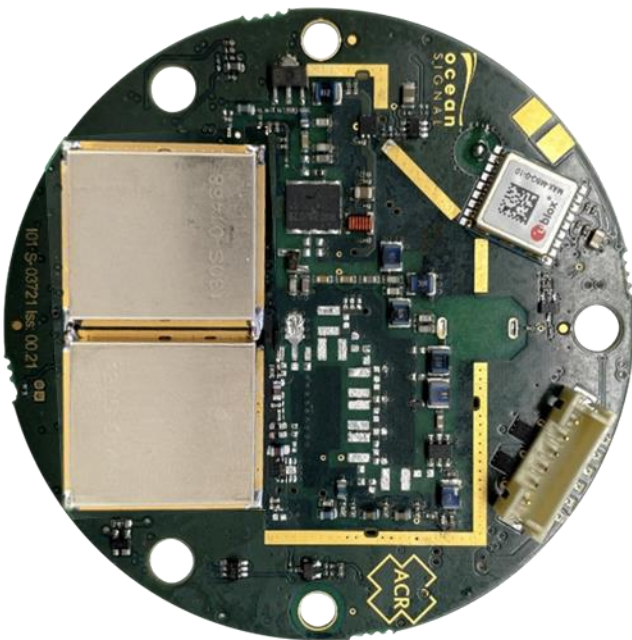
Figure 4: GlobalFix V6 PCB – Rear side.