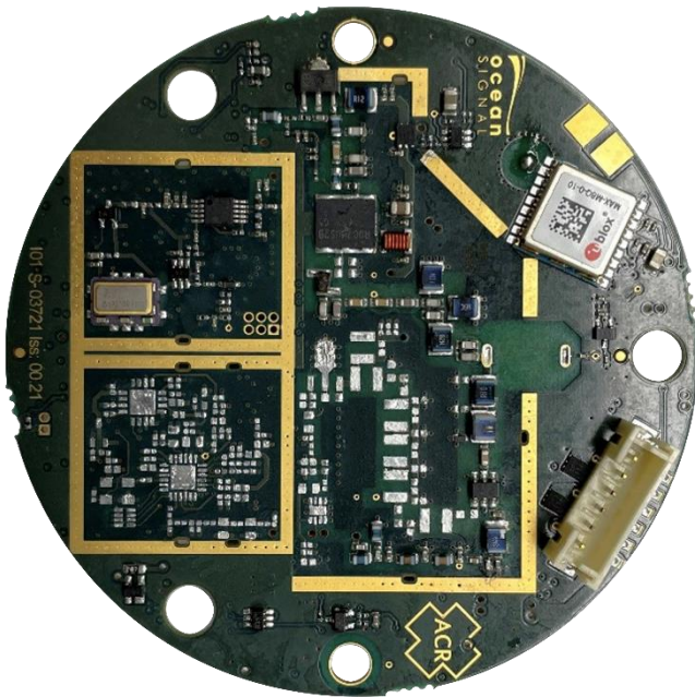
Figure 5: GlobalFix V6 PCB – Rear side with screening cans removed.