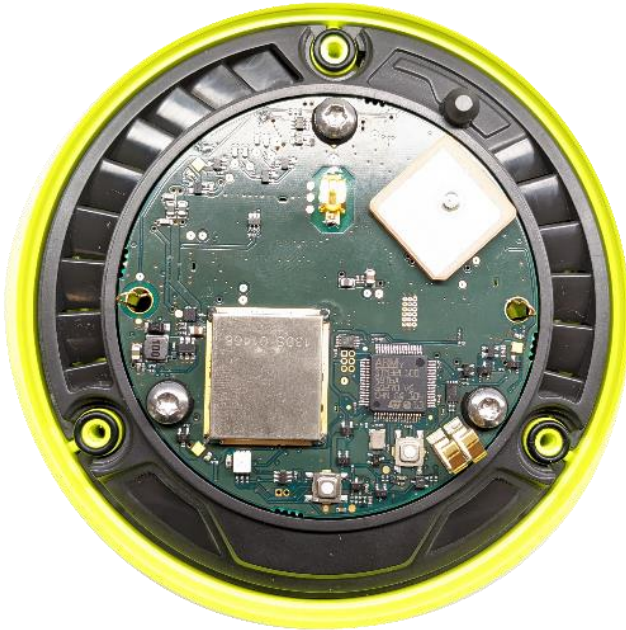
Figure 1: GlobalFix V6 – Top view showing PCB in-situ.

Photographs showing the internal construction, battery pack and PCB assembly of the ACR GlobalFix V6 are shown in Figures 1 to 6 below.