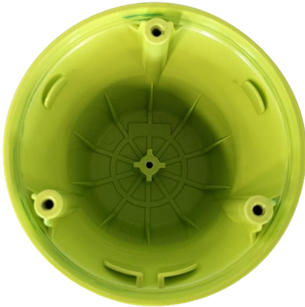
Figure 3: GlobalFix V6 – Top view, case only.