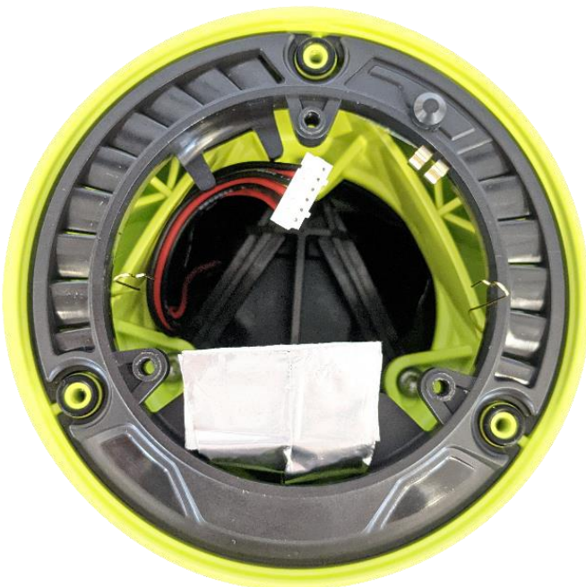
Figure 2: GlobalFix V6 – Top view, PCB removed showing battery carrier in-situ.