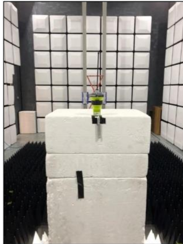
1 GHz to 2 GHz, Y Orientation