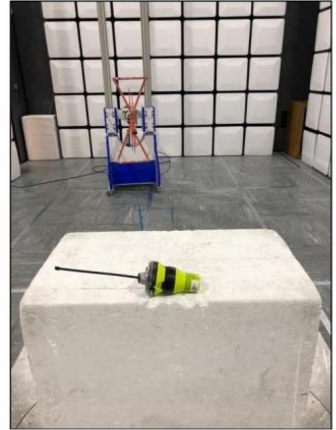
30 MHz to 1 GHz, Z Orientation