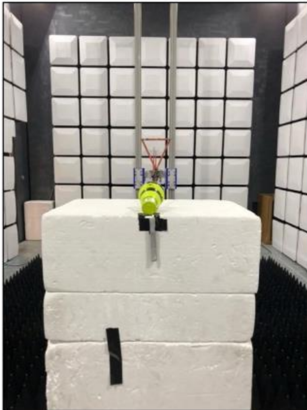
1 GHz to 2 GHz, X Orientation