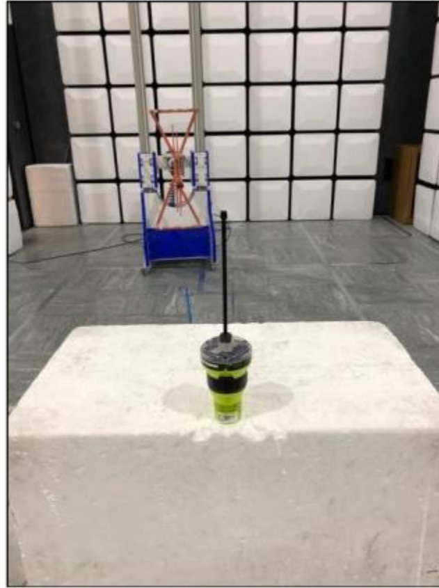
30 MHz to 1 GHz, Y Orientation