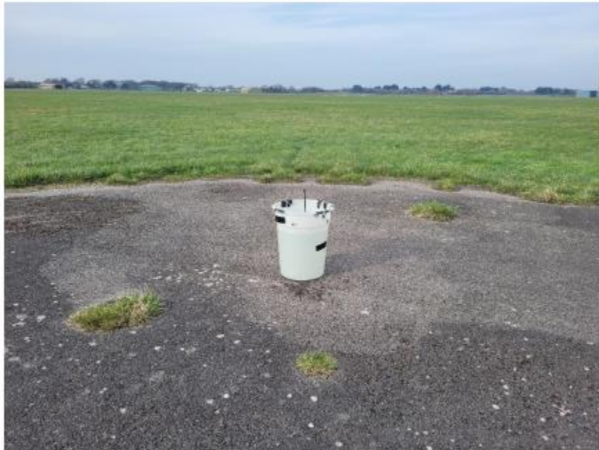
Satellite Qualitative Test – Configuration 5