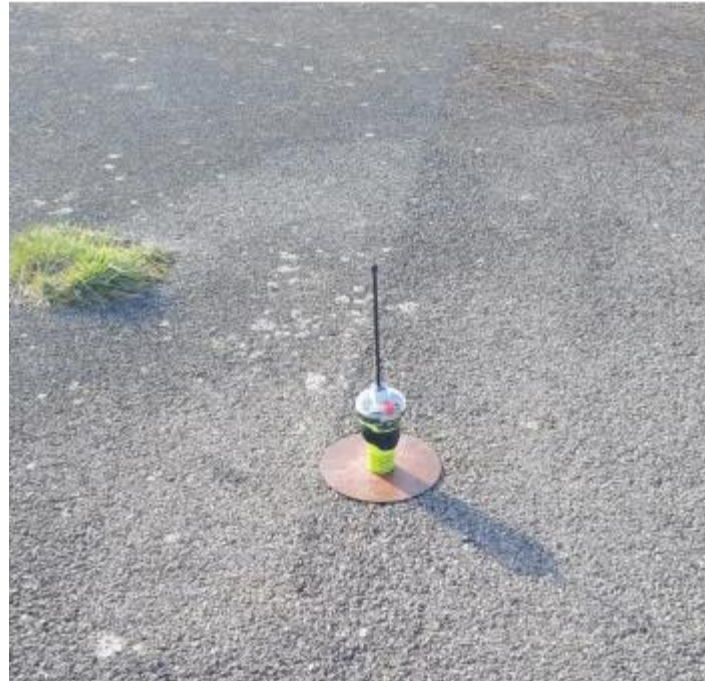
Satellite Qualitative Test – Configuration 7