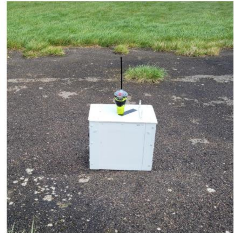
Position Acquisition Time and Position Accuracy Test – Configuration 5 – A.3.8.2.2