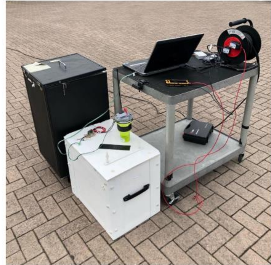
UTC Test – Configuration 8