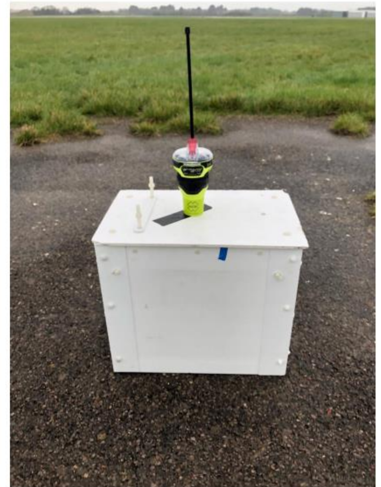
Satellite Qualitative Test – Configuration 8