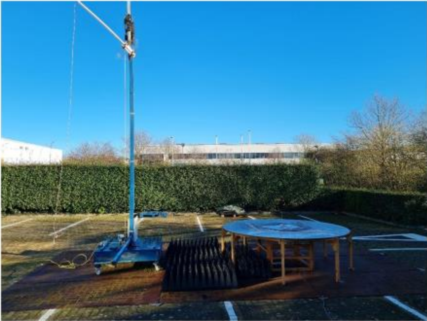
Antenna Characteristics – Configuration 1