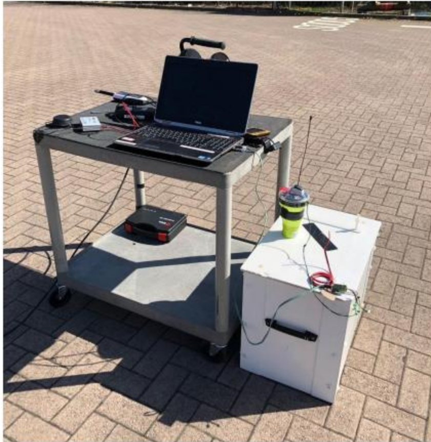
Moffset Test – Configuration 8