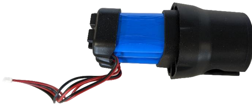
Figure 6: GlobalFix V5 – Battery pack in carrier.