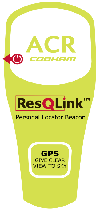
Front Pad Printing