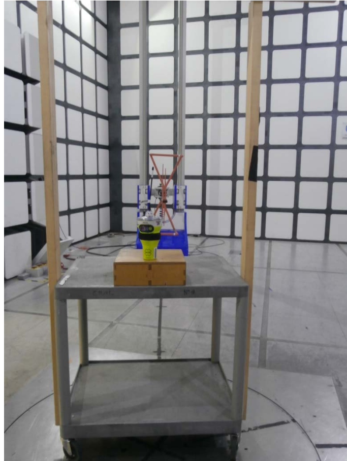
FCC Part 80.211 Radiated Unwanted Emissions