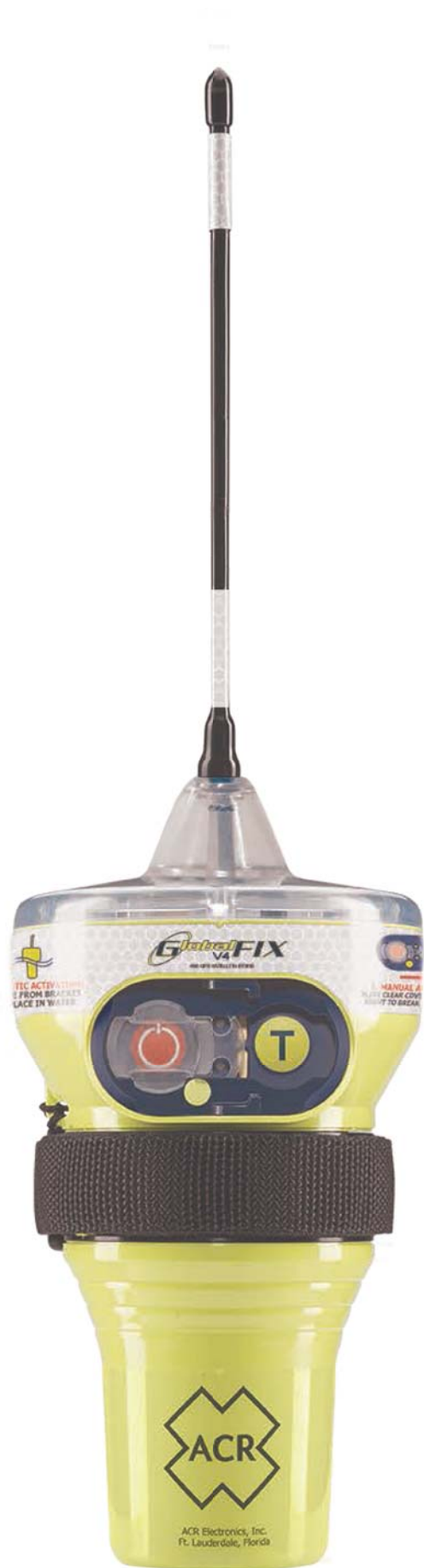
ACR RLB-41 GlobalFix™ V4 EPIRB, Front View