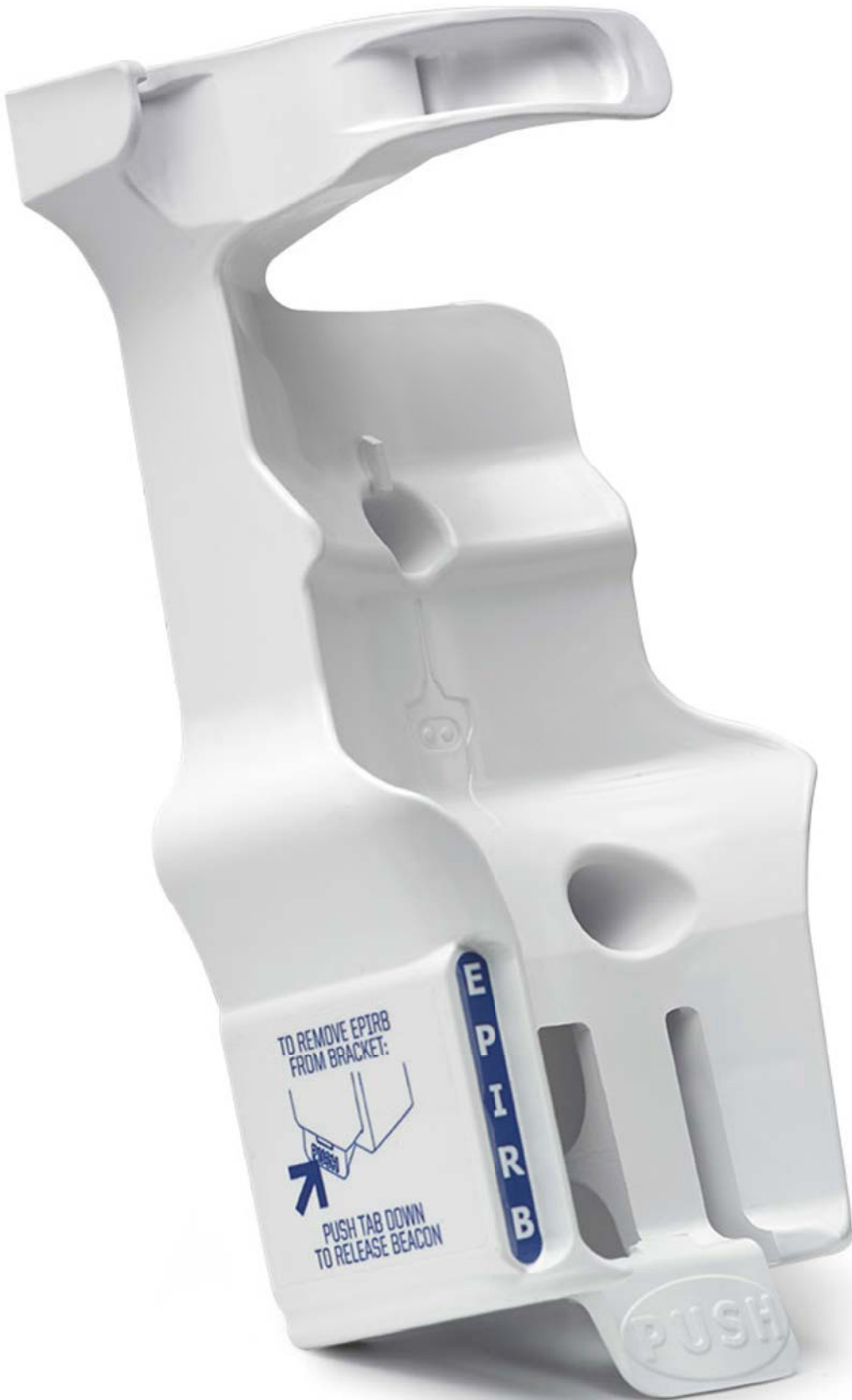
ACR RLB-41 GlobalFix™ V4 EPIRB Category II Bracket, Angle View