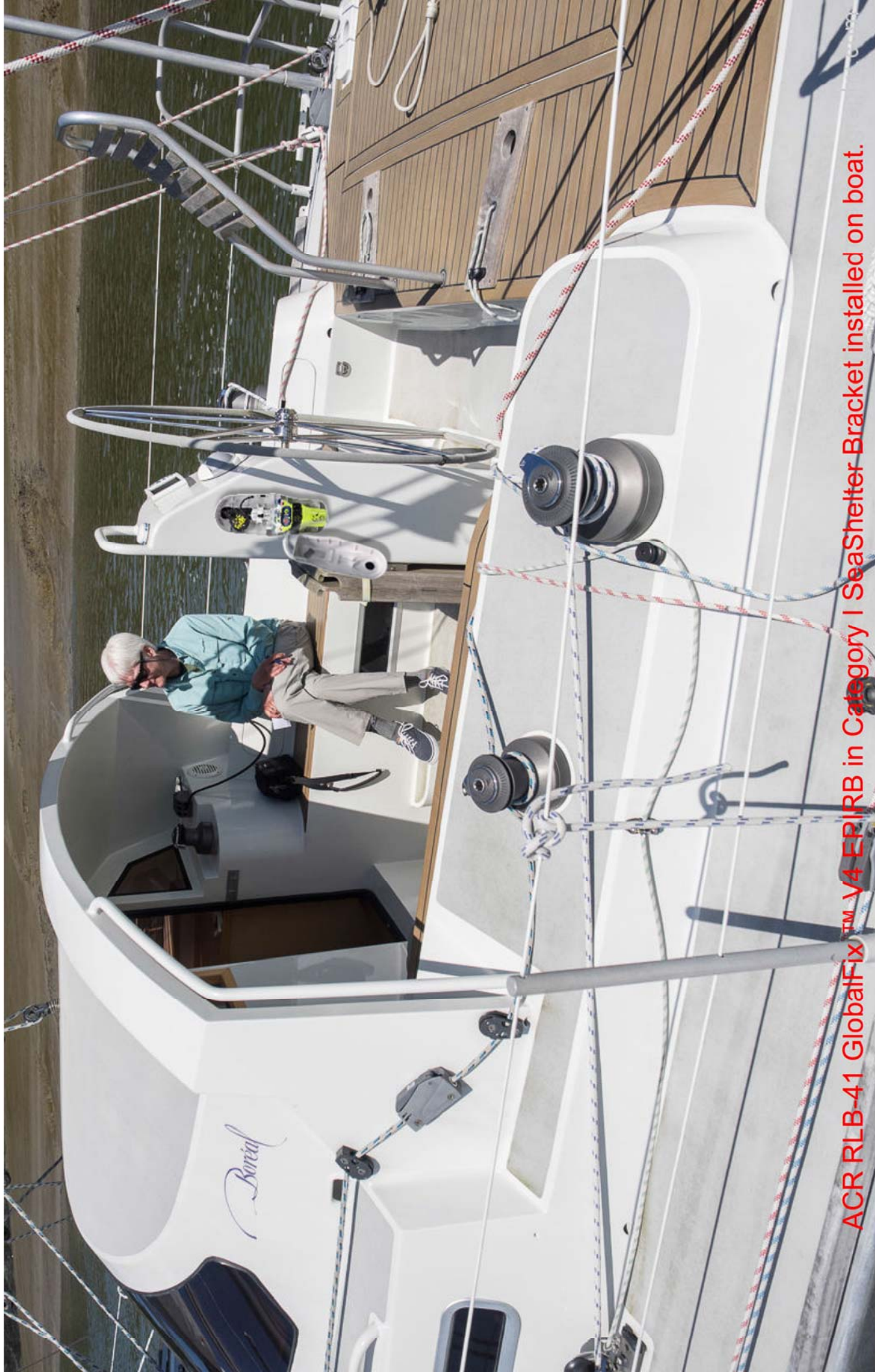
ACR RLB-41 GlobalFix™ V4 EPIRB in Category I SeaShelter Bracket installed on boat.