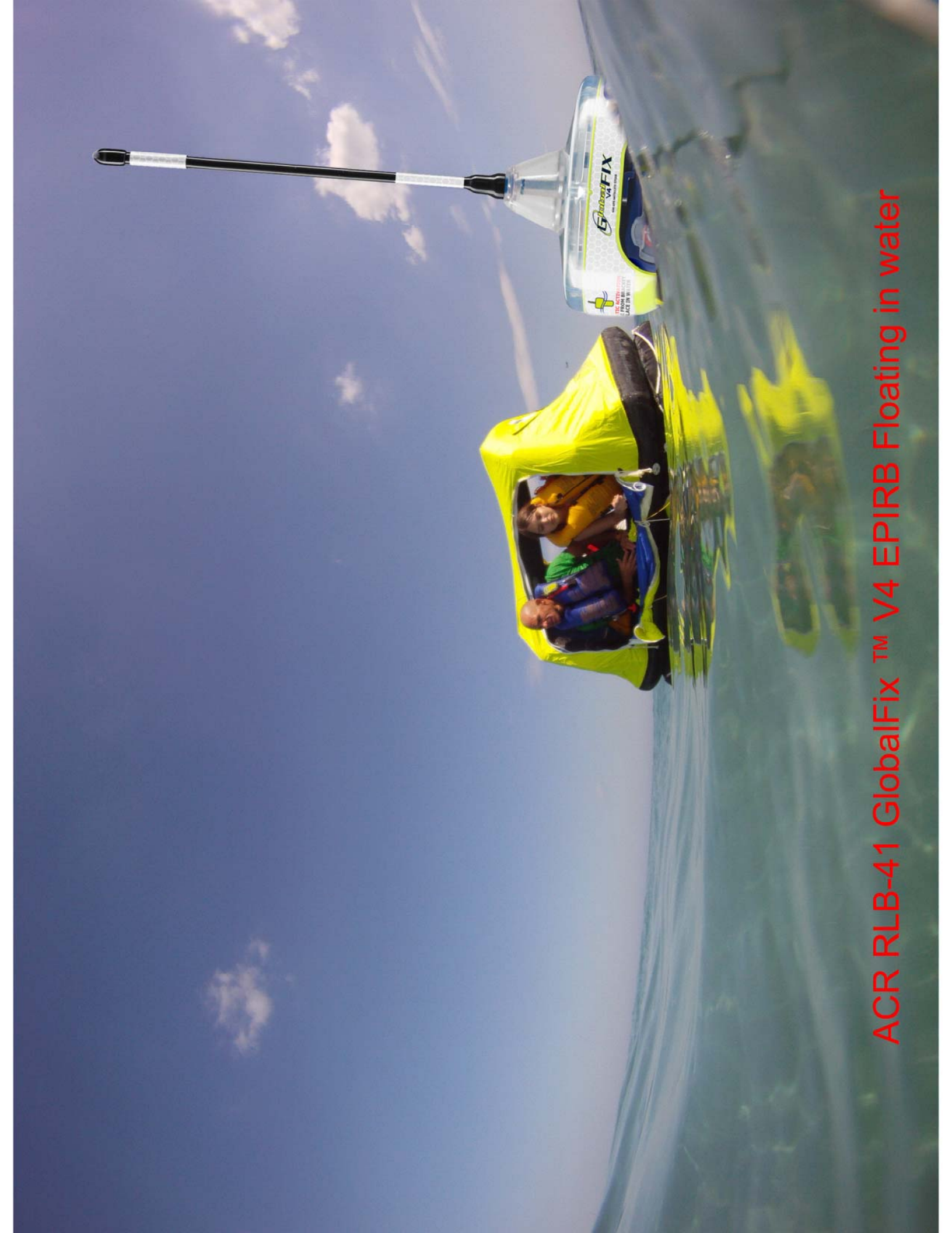
ACR RLB-41 GlobalFix™ V4 EPIRB Floating in water