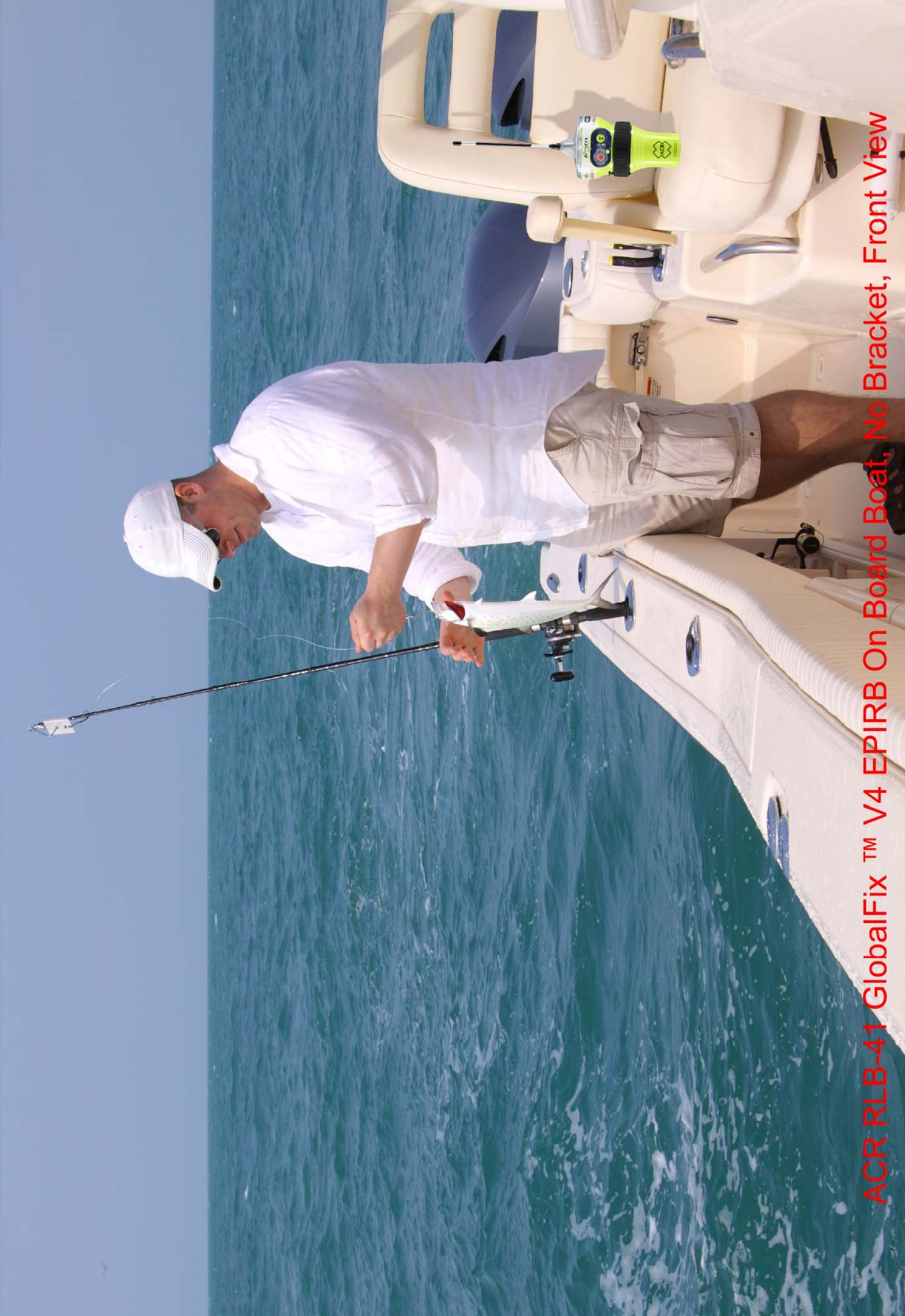
ACR RLB-41 GlobalFix™ V4 EPIRB On Board Boat, No Bracket, Front View