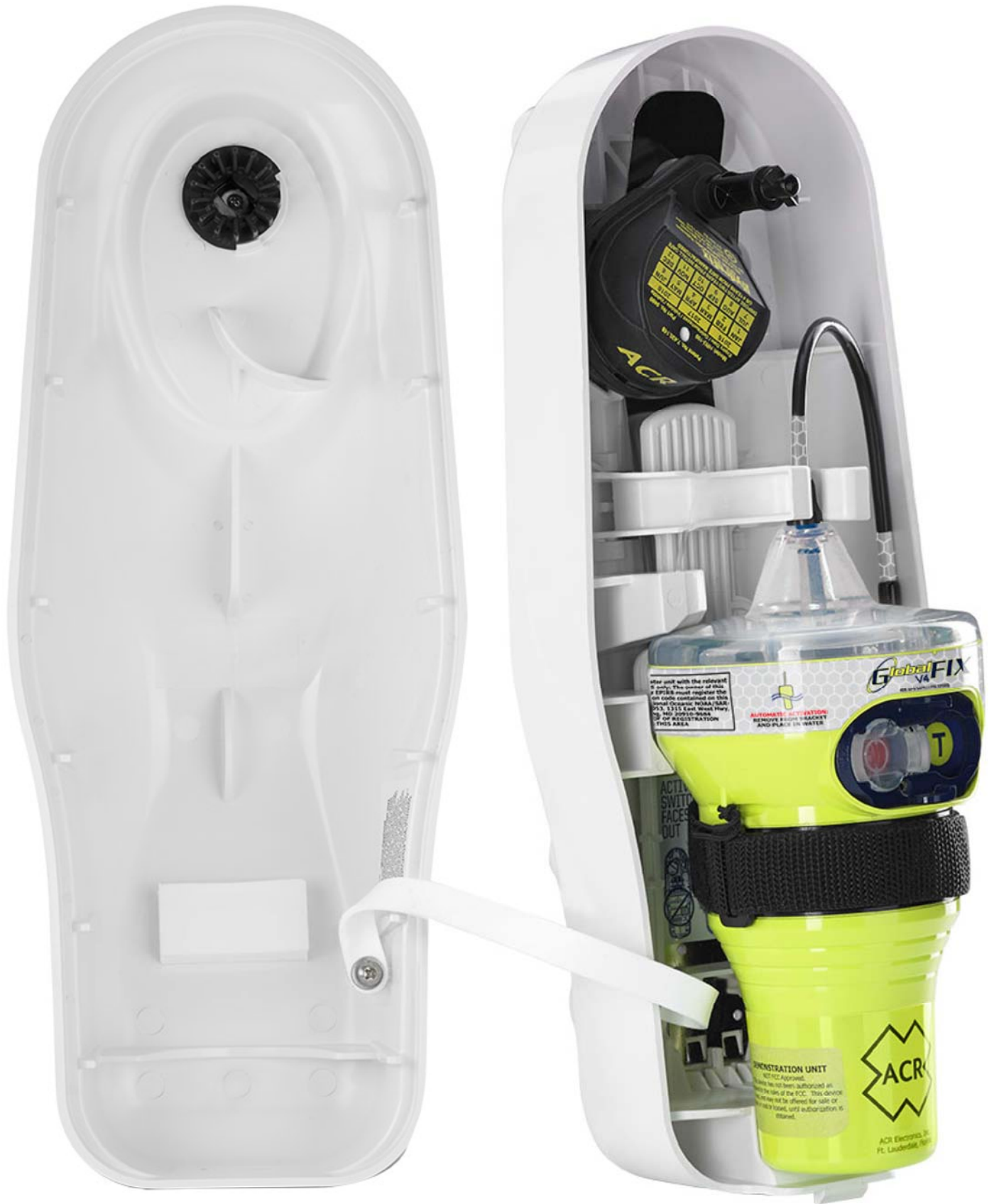
ACR RLB-41 GlobalFix™ V4 EPIRB in Category I SeaShelter Bracket, Angle View