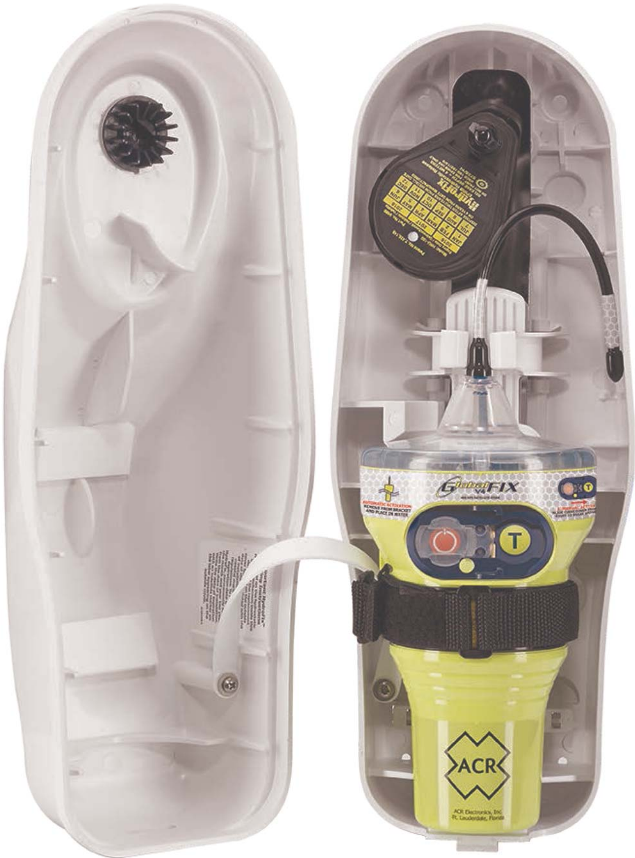
ACR RLB-41 GlobalFix™ V4 EPIRB in Category I SeaShelter Bracket, Front View