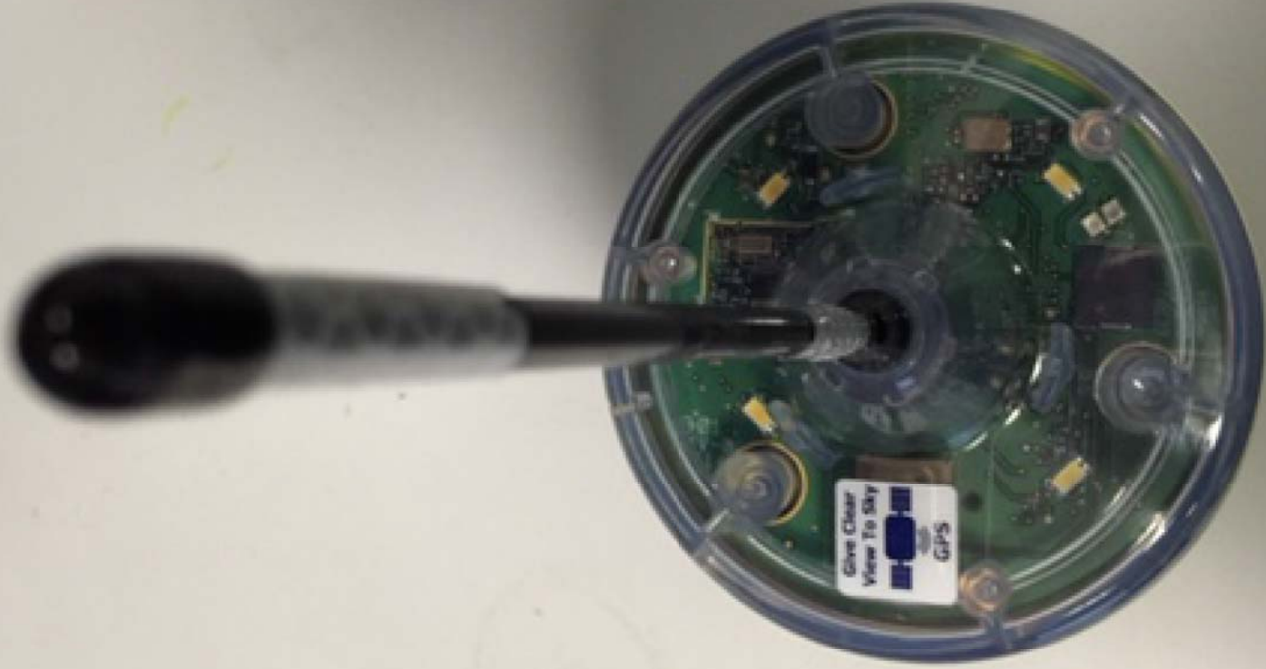
ACR RLB-41 GlobalFix™ V4 EPIRB, Top View