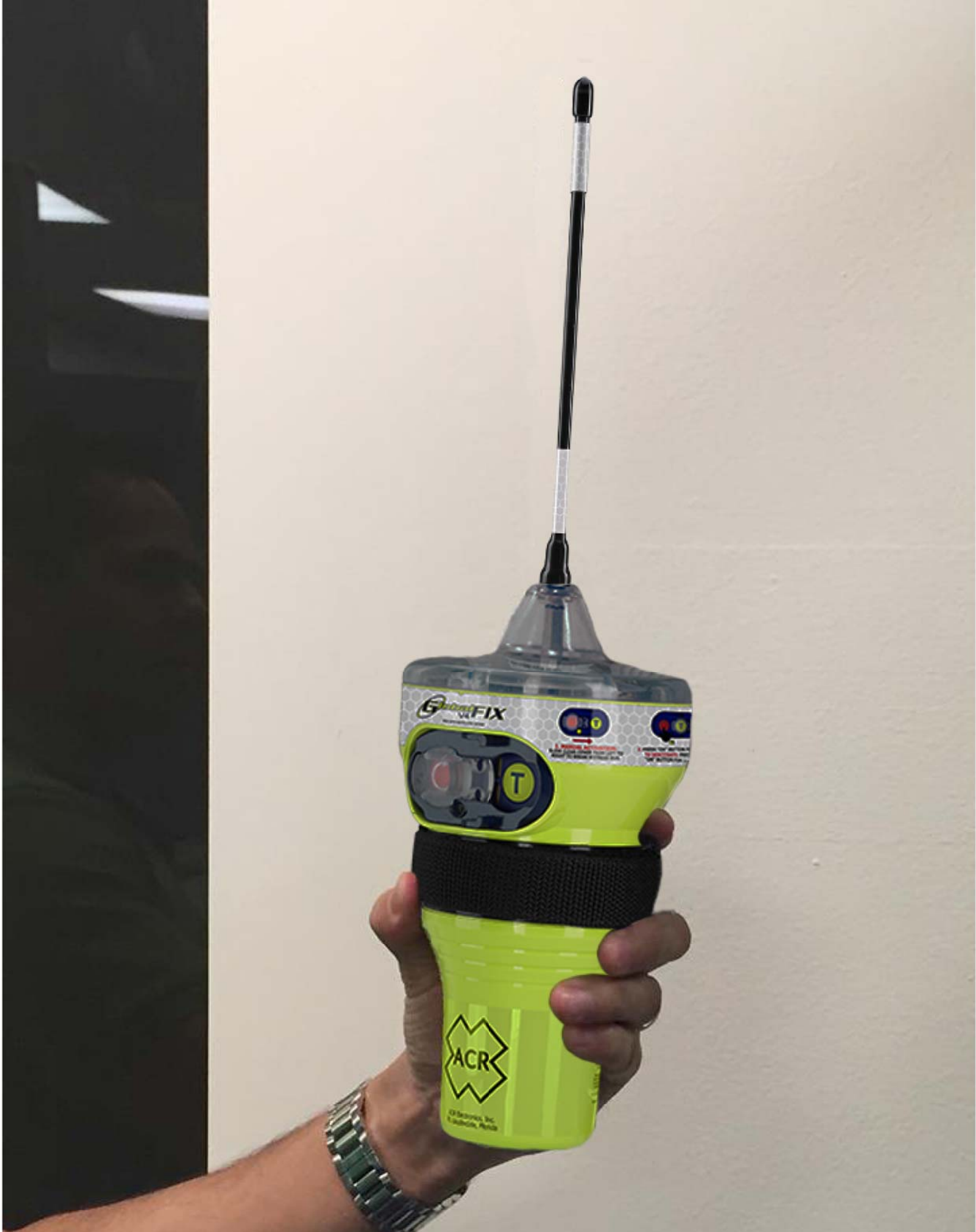
ACR RLB-41 GlobalFix™ V4 EPIRB, Handheld Angle View with Mfg Logo