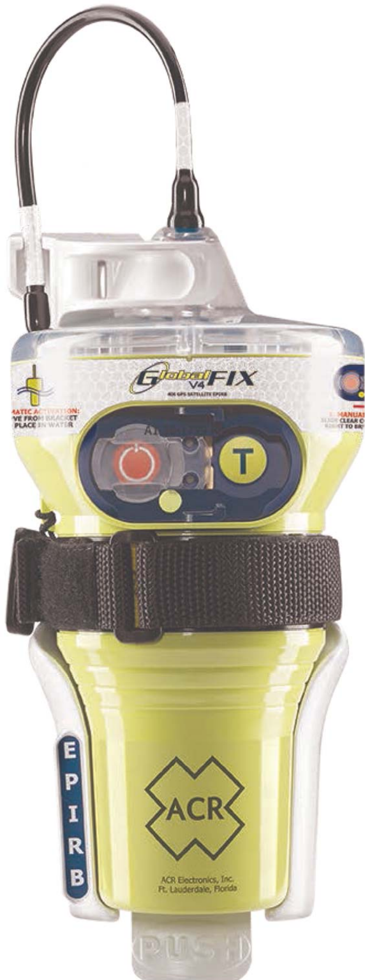
ACR RLB-41 GlobalFix™ V4 EPIRB in Category II Bracket, Front View