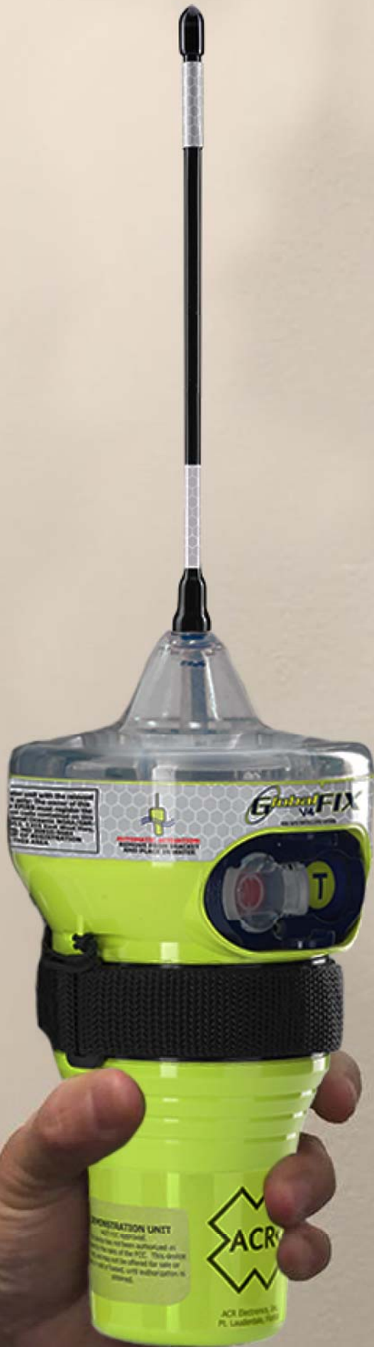
ACR RLB-41 GlobalFix™ V4 EPIRB Handheld showing Mfg Logo and beacon model name.