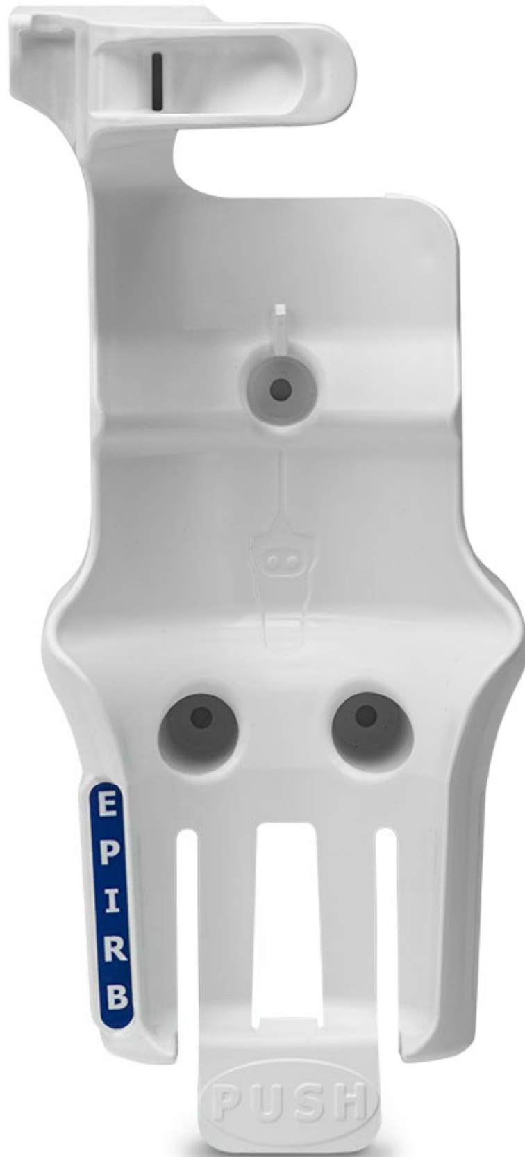
ACR RLB-41 GlobalFix™ V4 EPIRB Category II Bracket, Front View