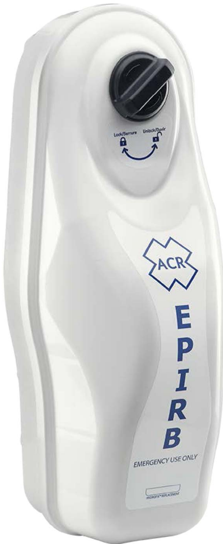
ACR RLB-41 GlobalFix™ V4 EPIRB Category I SeaShelter Bracket, Angle View