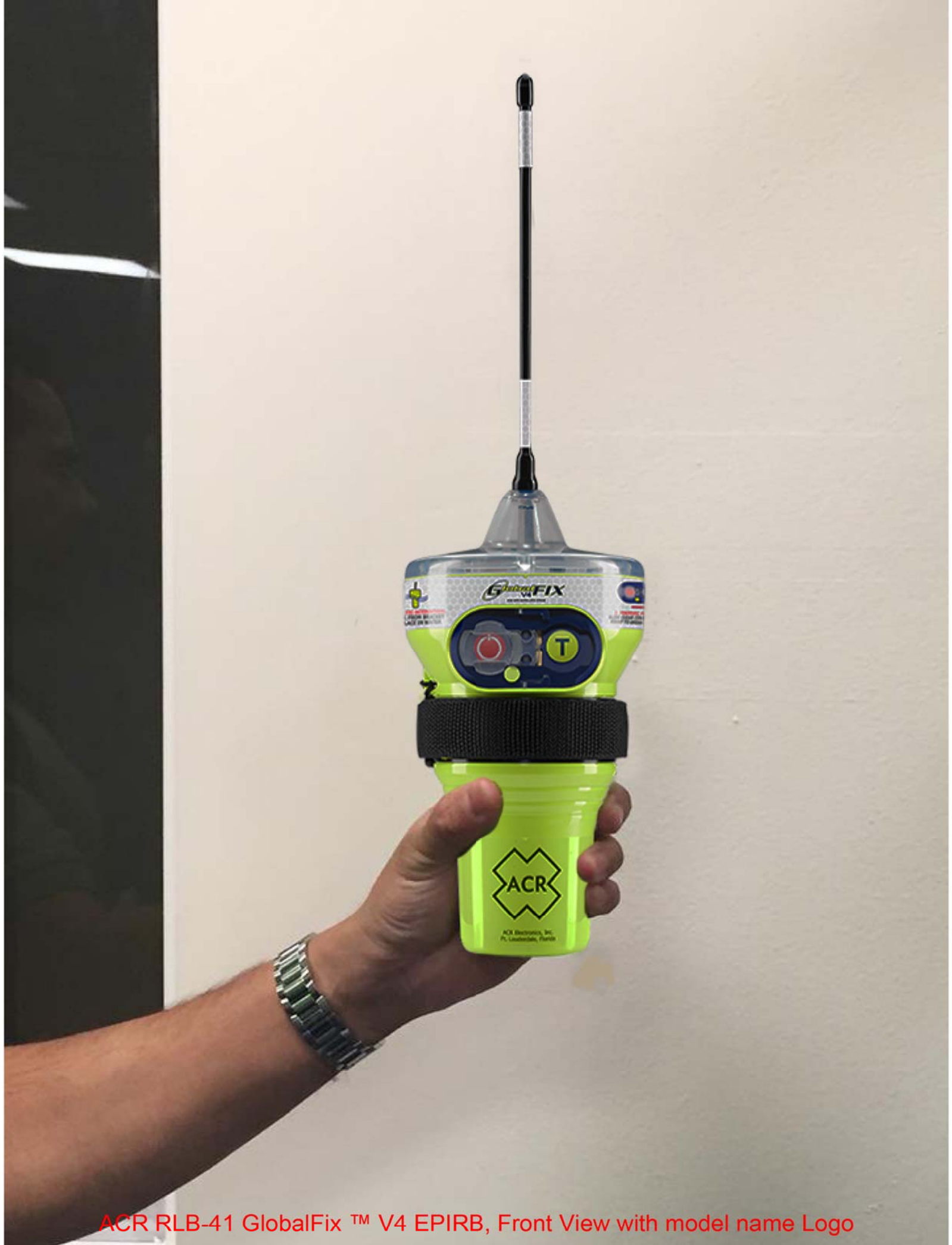
ACR RLB-41 GlobalFix™ V4 EPIRB, Front View with model name Logo