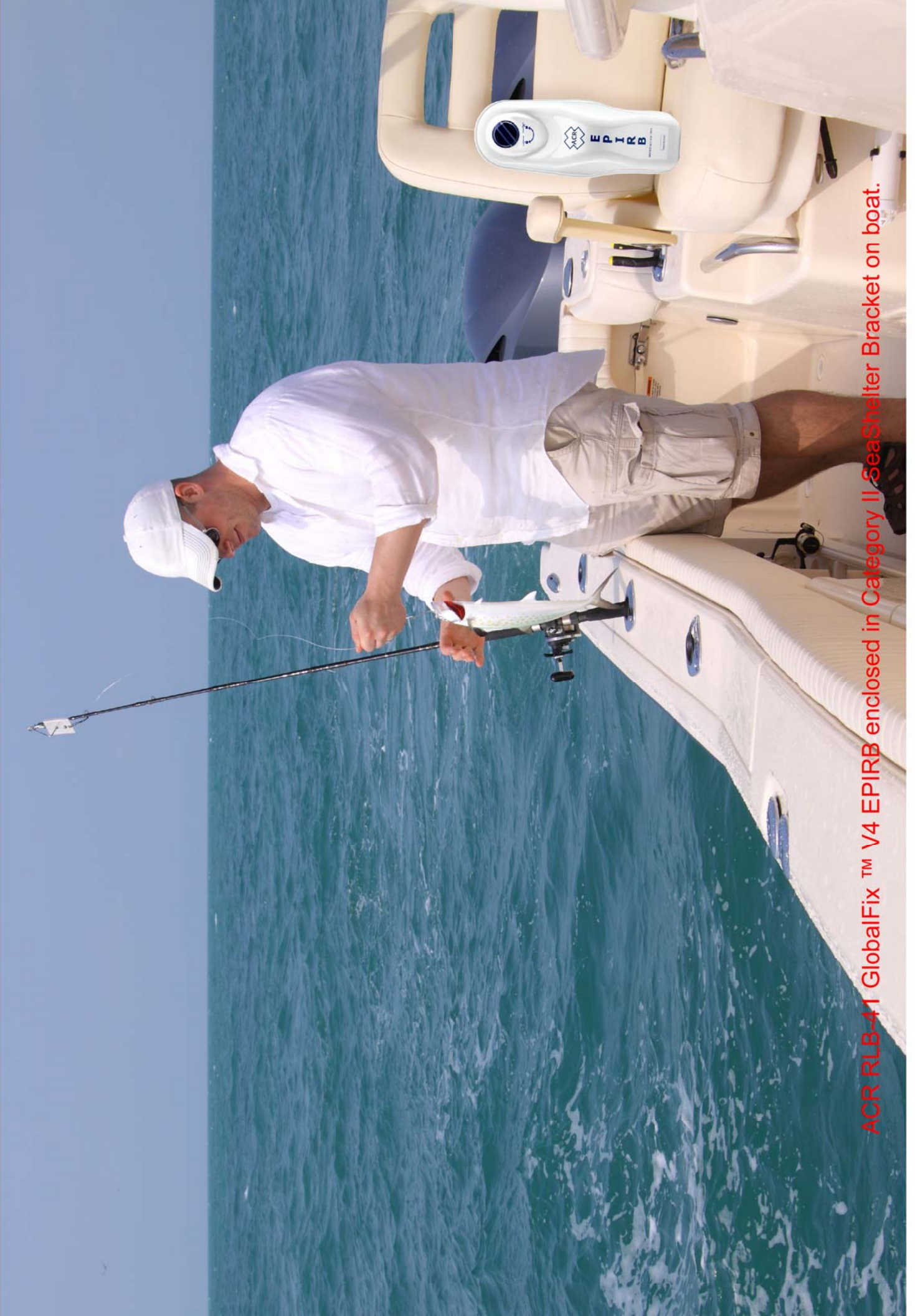
ACR RLB-41 GlobalFix™ V4 EPIRB enclosed in Category II SeaShelter Bracket on boat.