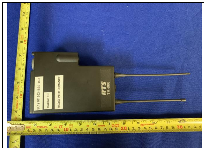
EUT - Front View