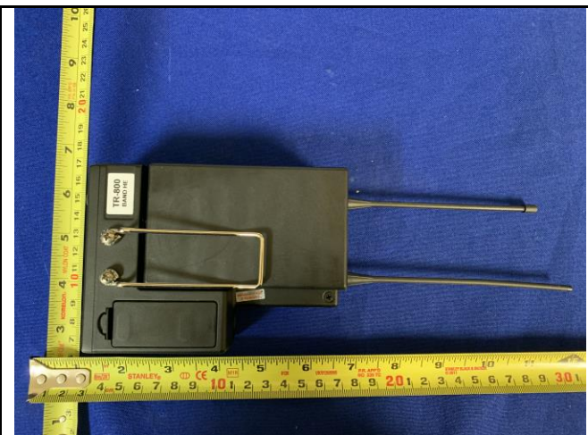
EUT - Rear View