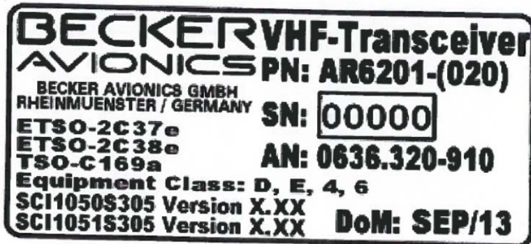
Figure 2-1: Type plate (example)

The device type is defined by the type plate (on the housing):